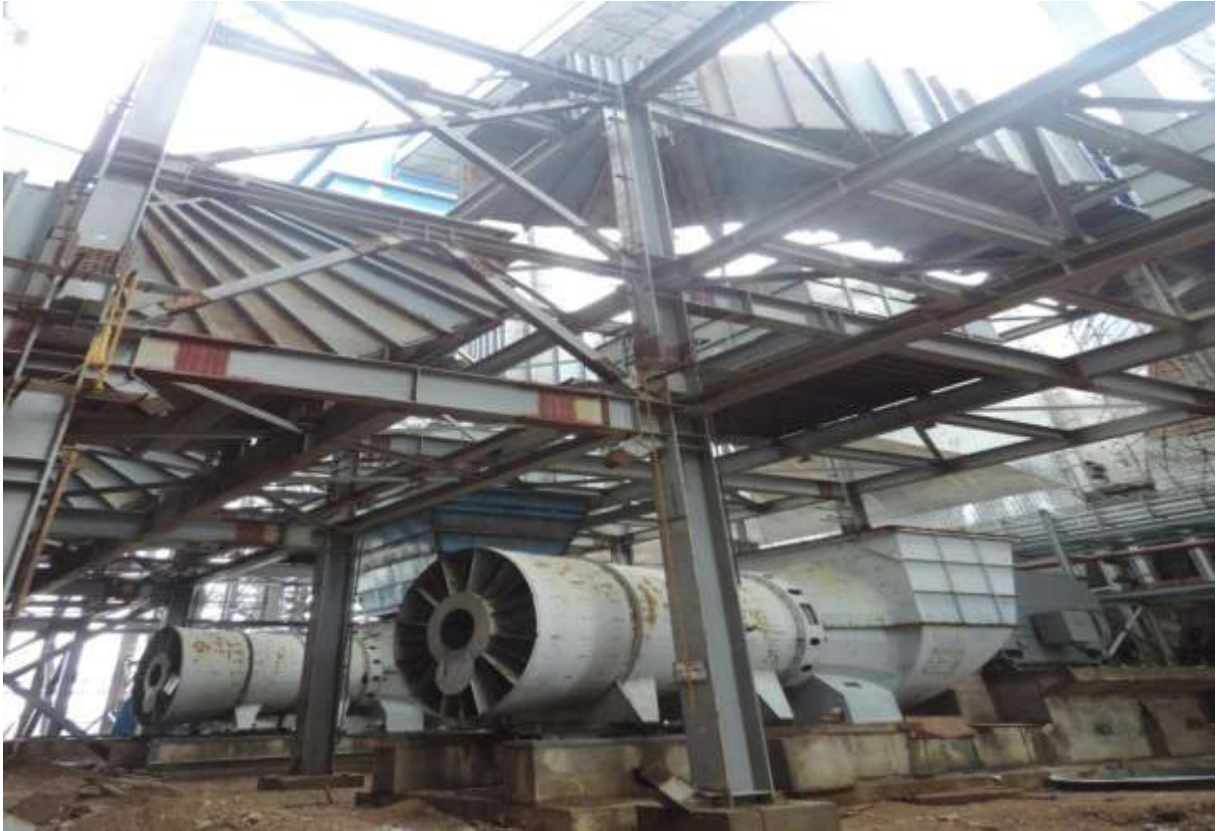
PA & FD Fan – Alignment of Motor, bearing housing in PA Fan under progress