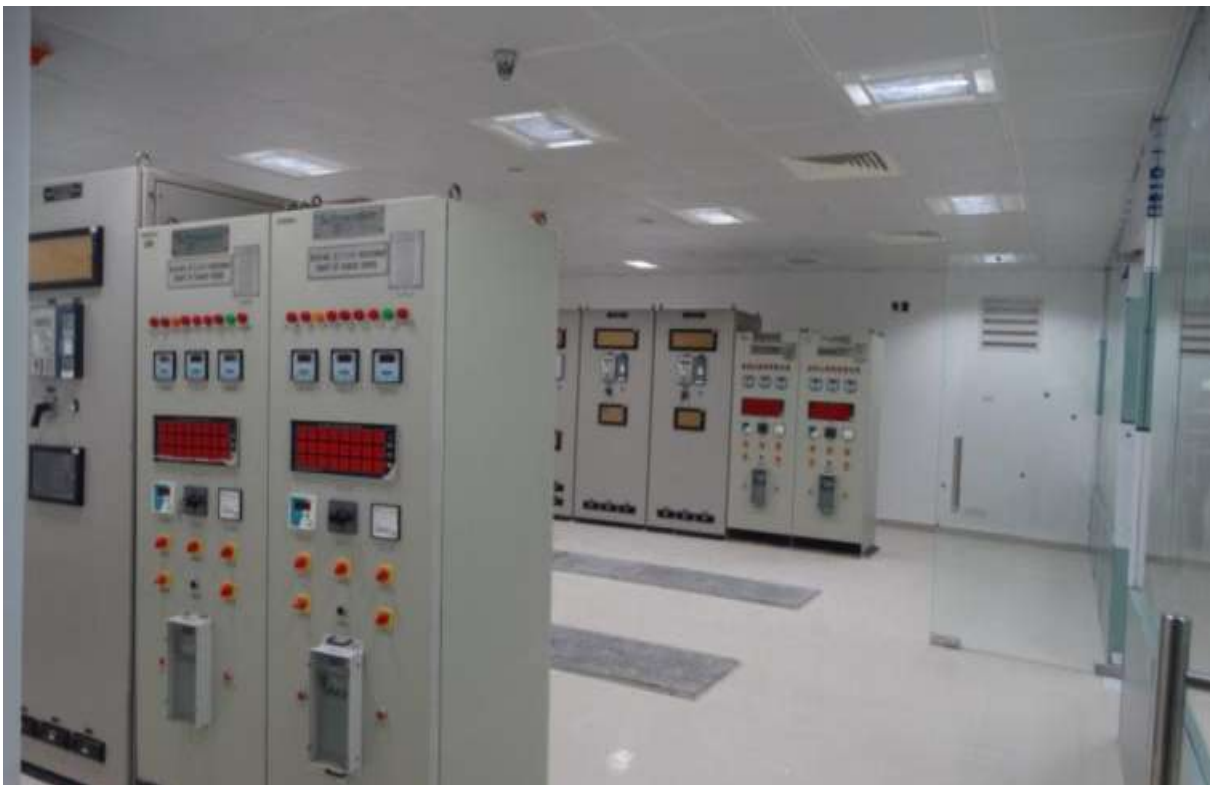
PHB - DCS Panel erection completed in CCR