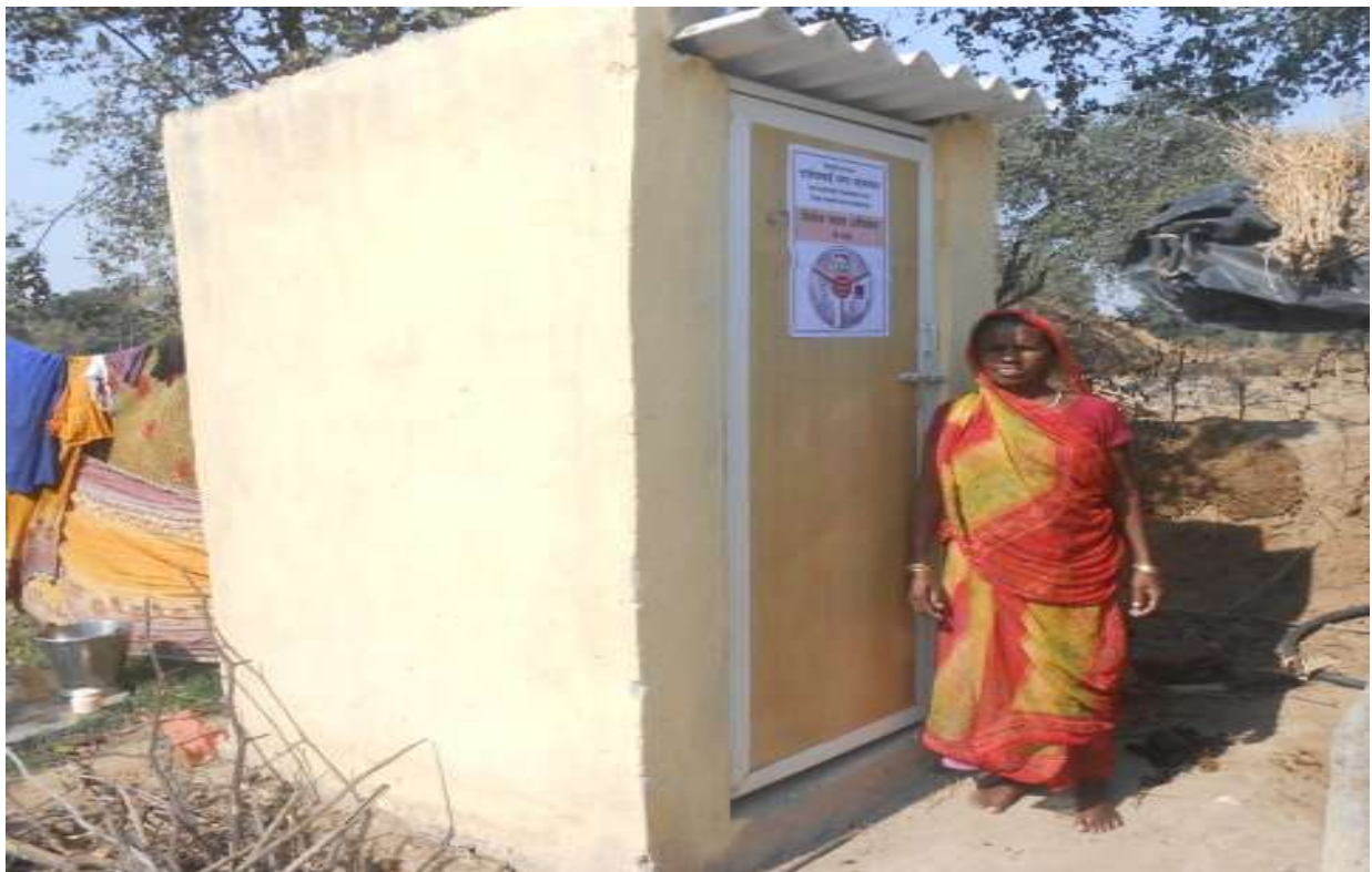
Provided House-Hold Toilets