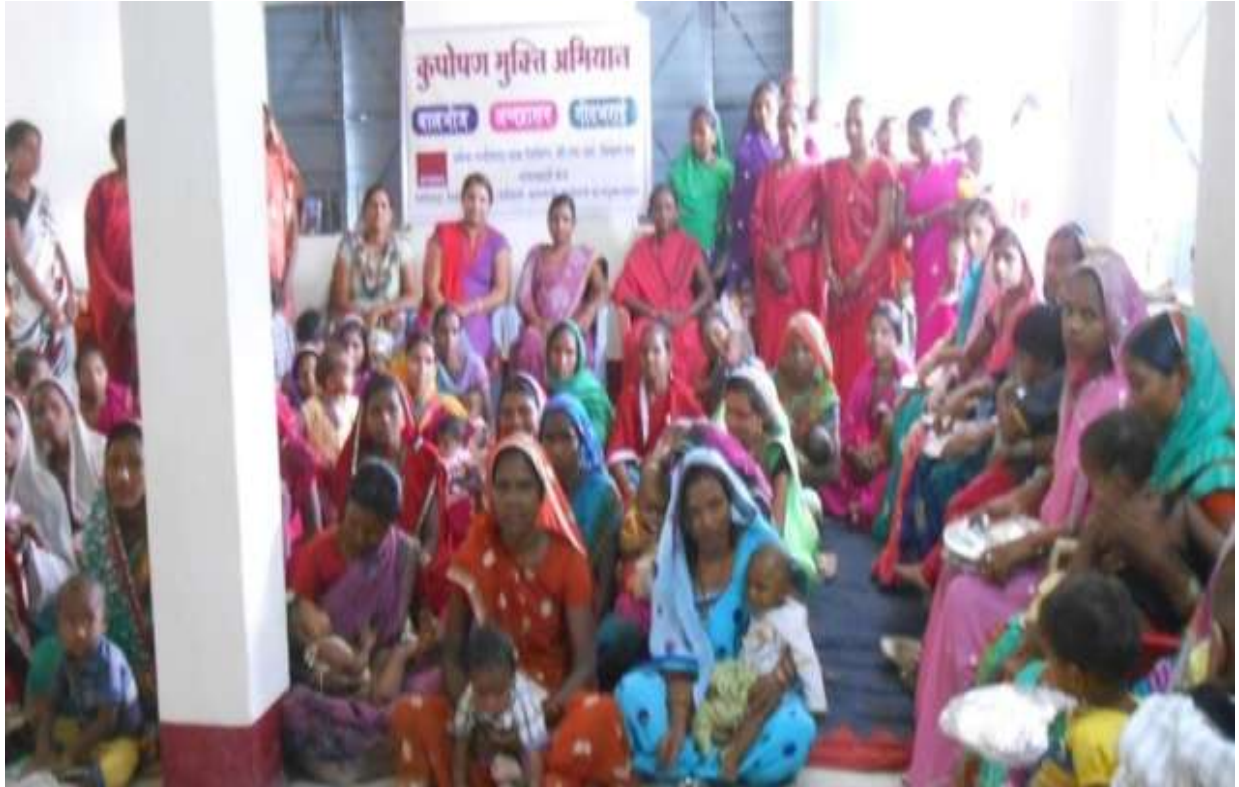
Program for Kuposhan Mukti Abhiyan