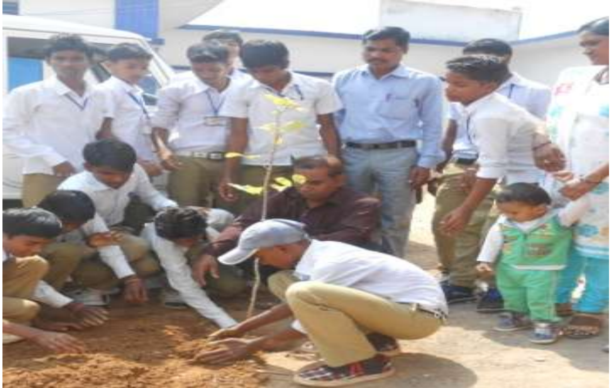
Plantation in High School at Dhurkot