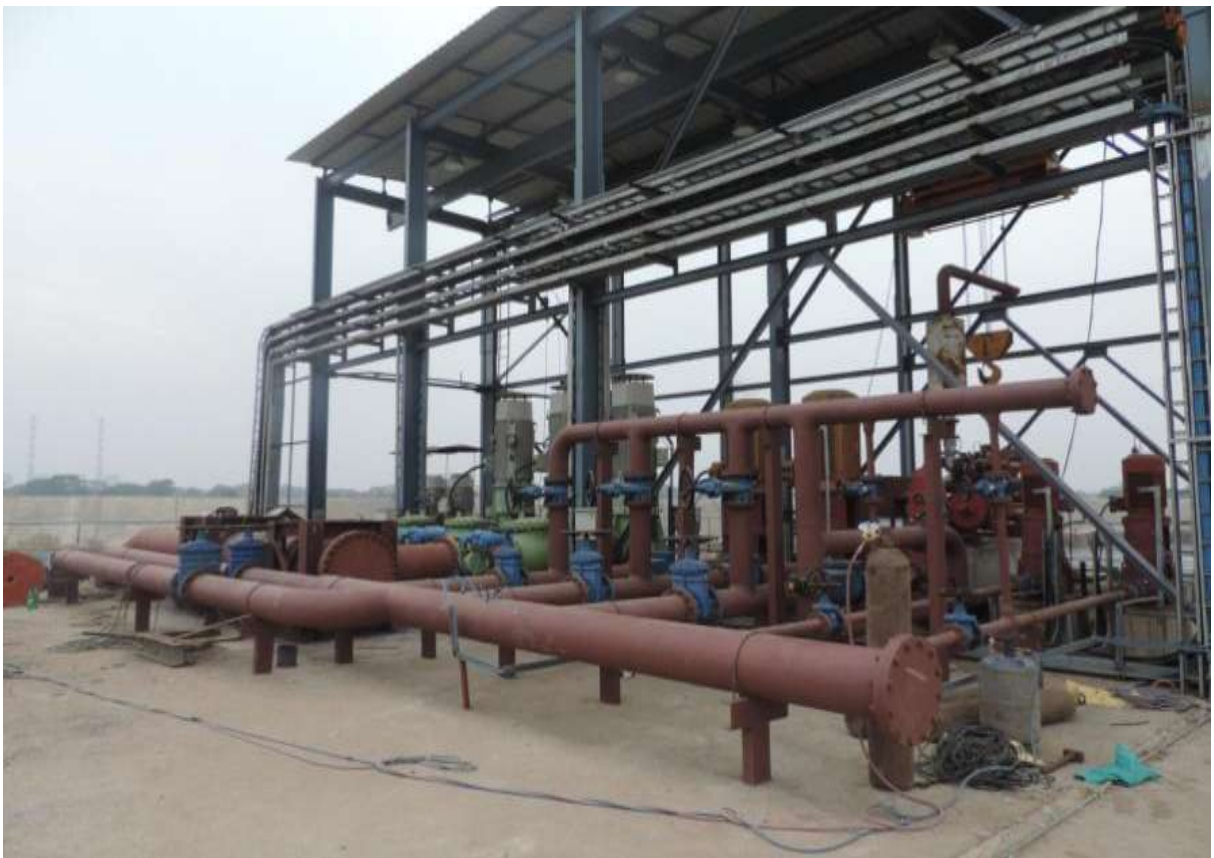
Raw Water Pump House - Power and control cable laying for CW makeup pumps under progress