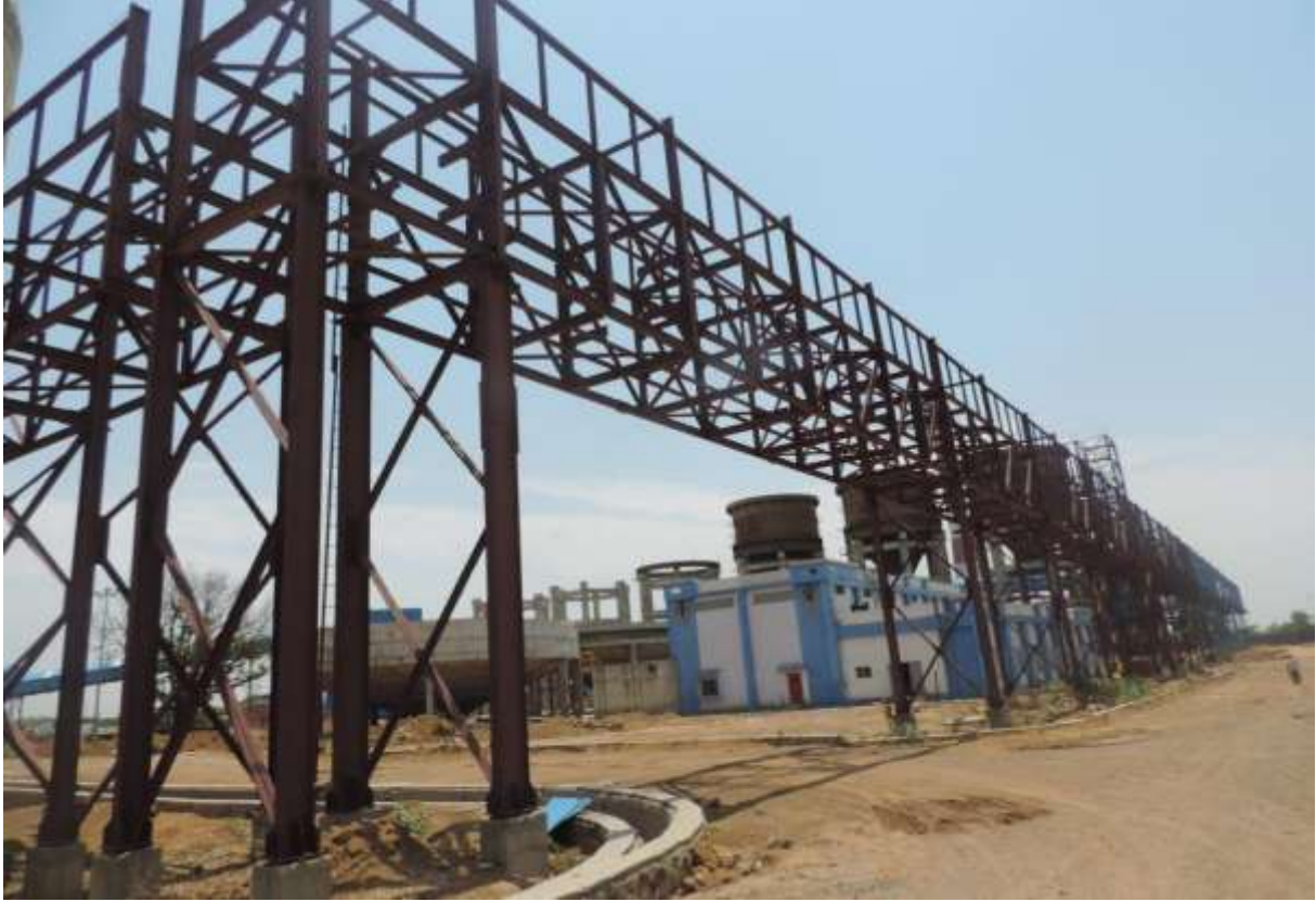
Ash pipe rack - Erection of trestle & galleries are in progress