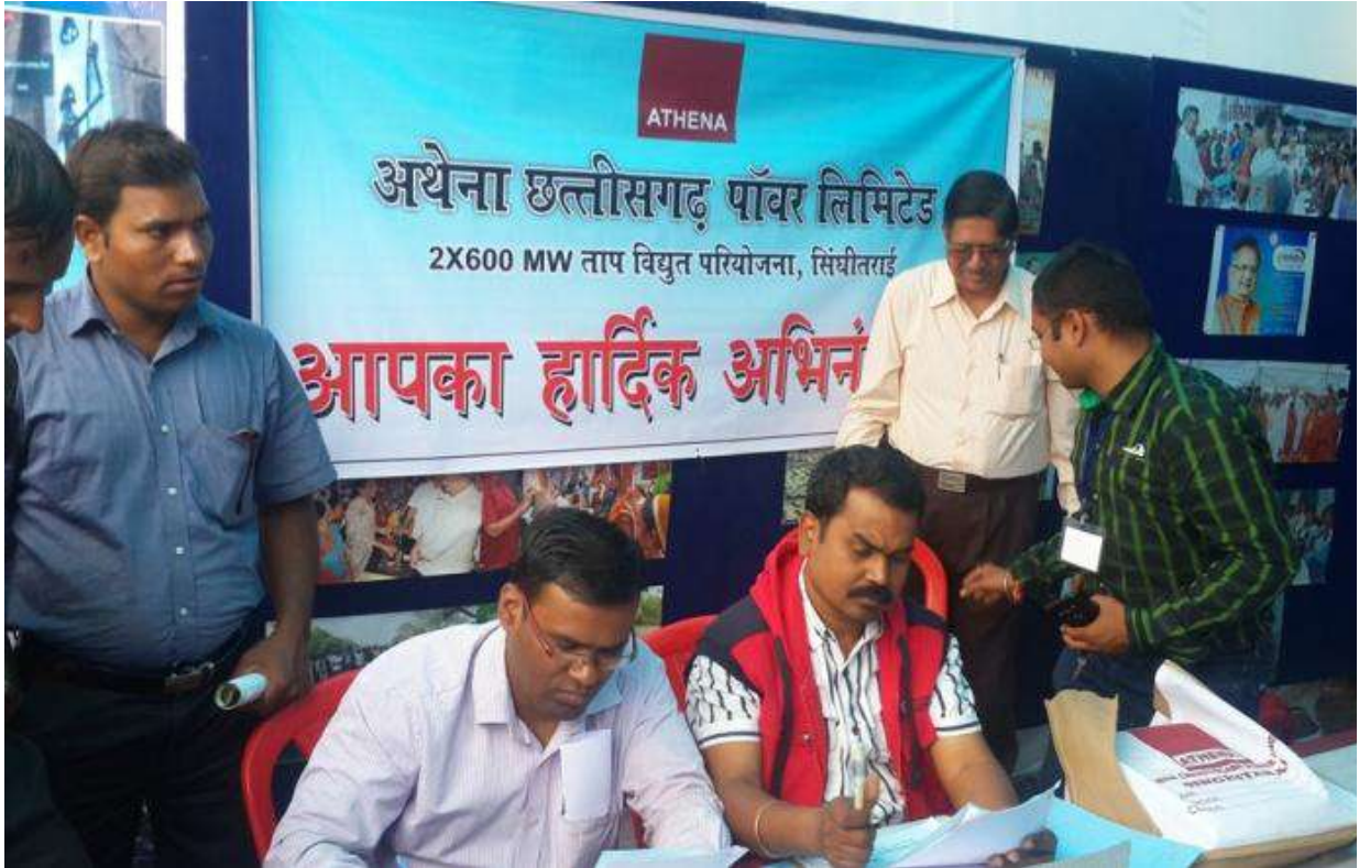
Rojgar Mela at Janjgir Champa