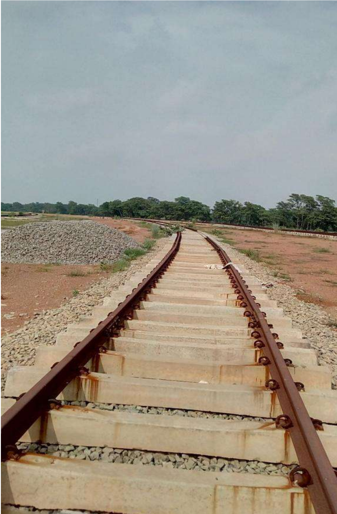
Railway siding –Linking works under progress