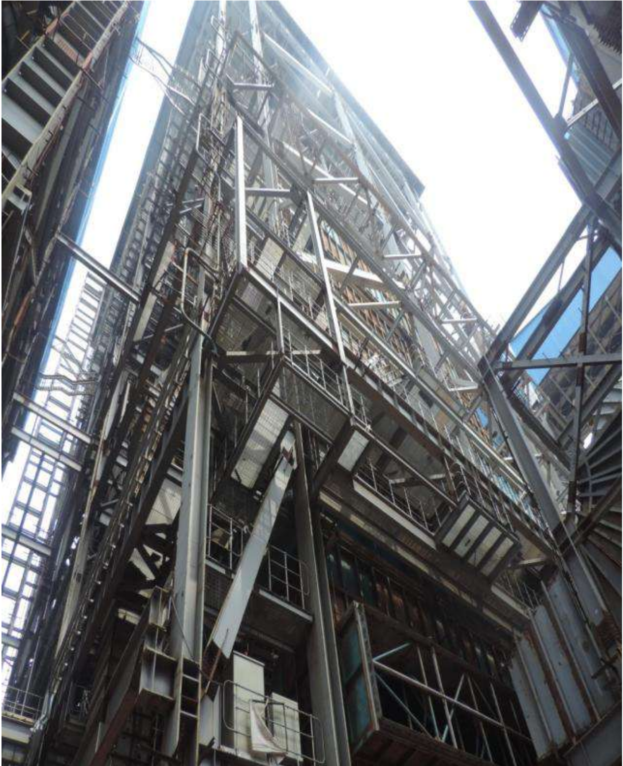
Boiler # 1 – Flue gas ducting works under progress