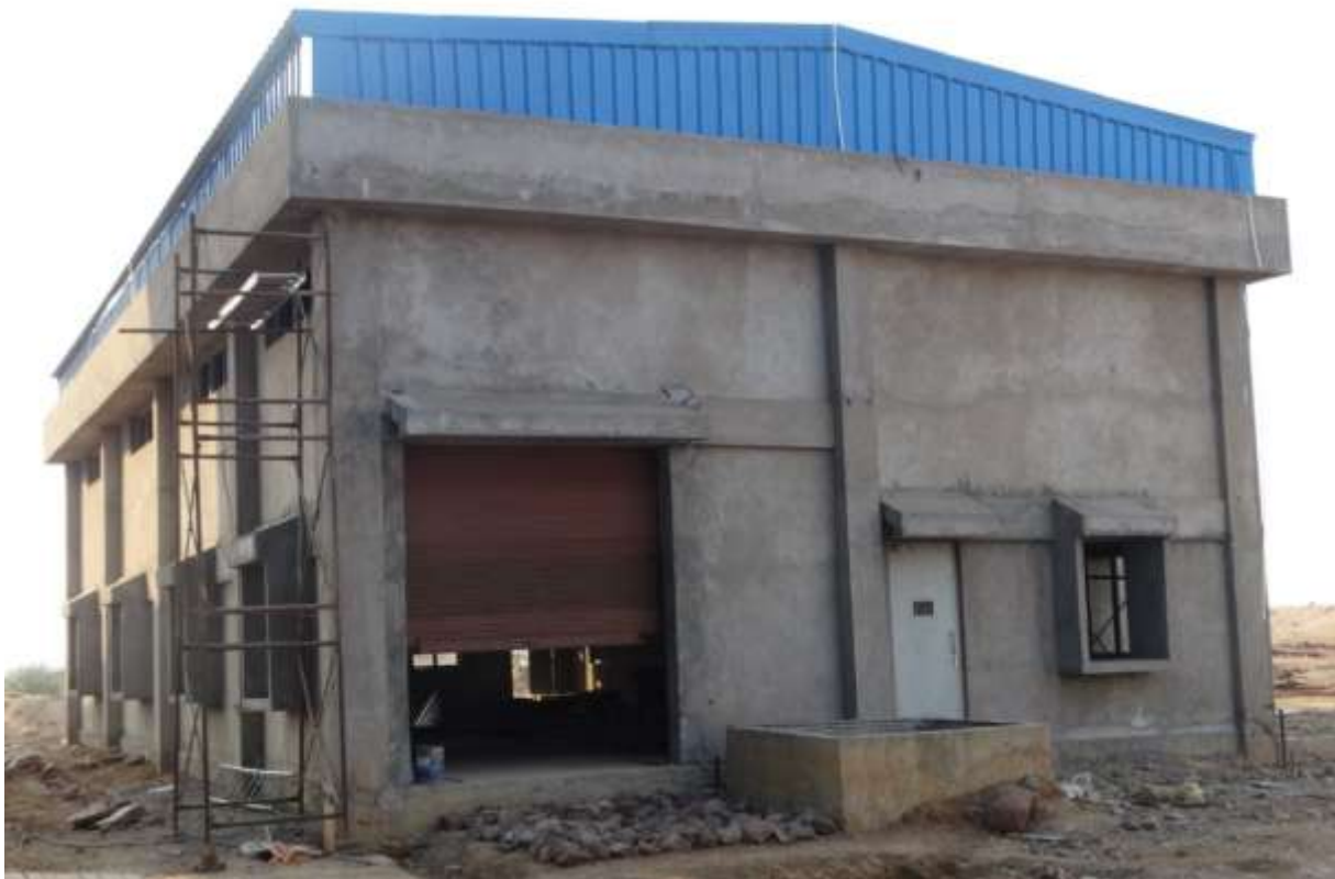
Compressor house CHP - Civil works in progress