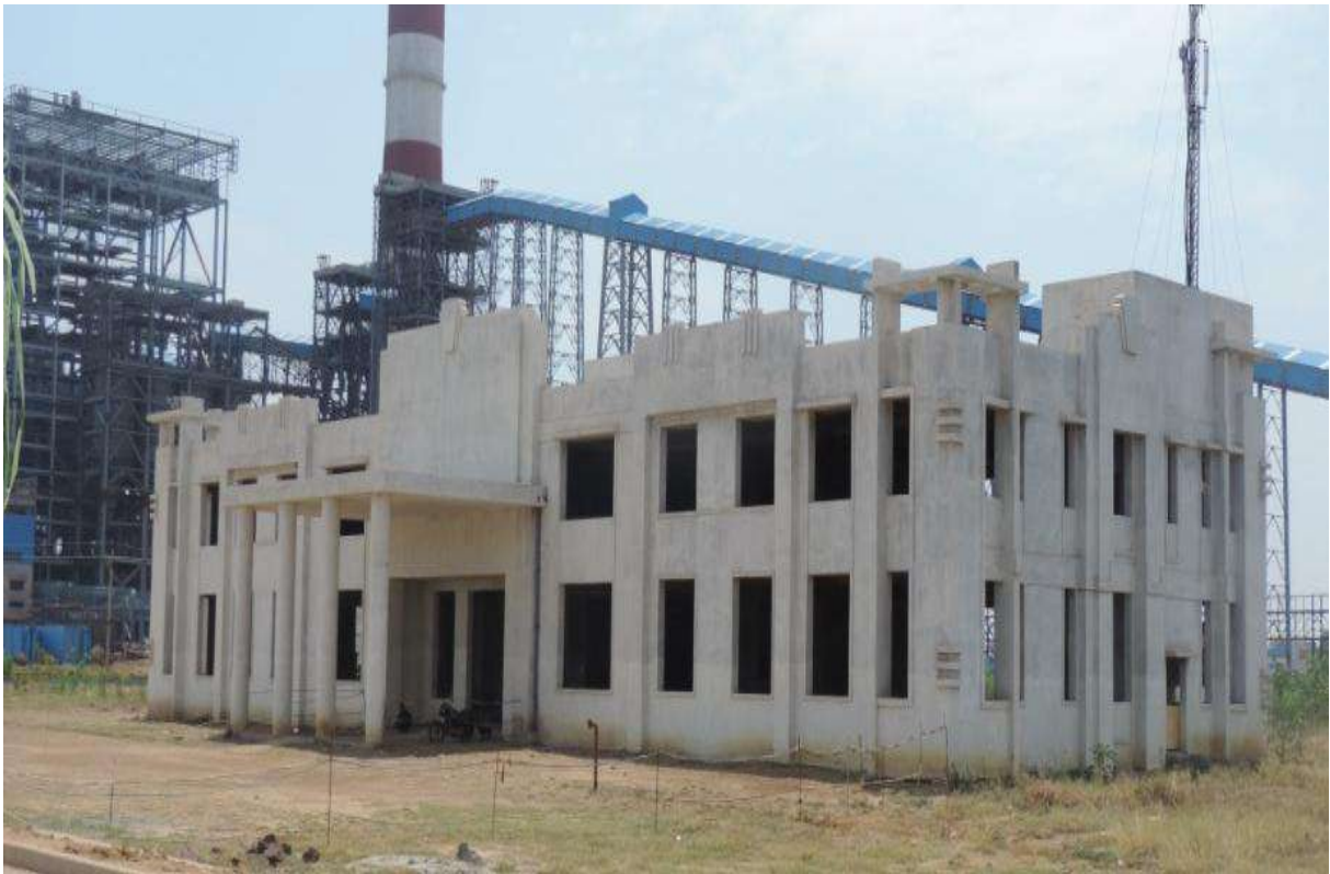
Admin Building – Finishing works are in Progress