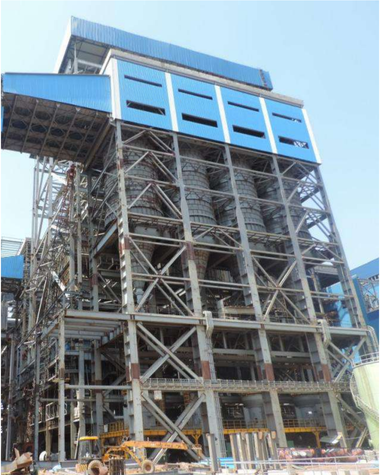
Bunker # 1A – Painting and cladding work in progress