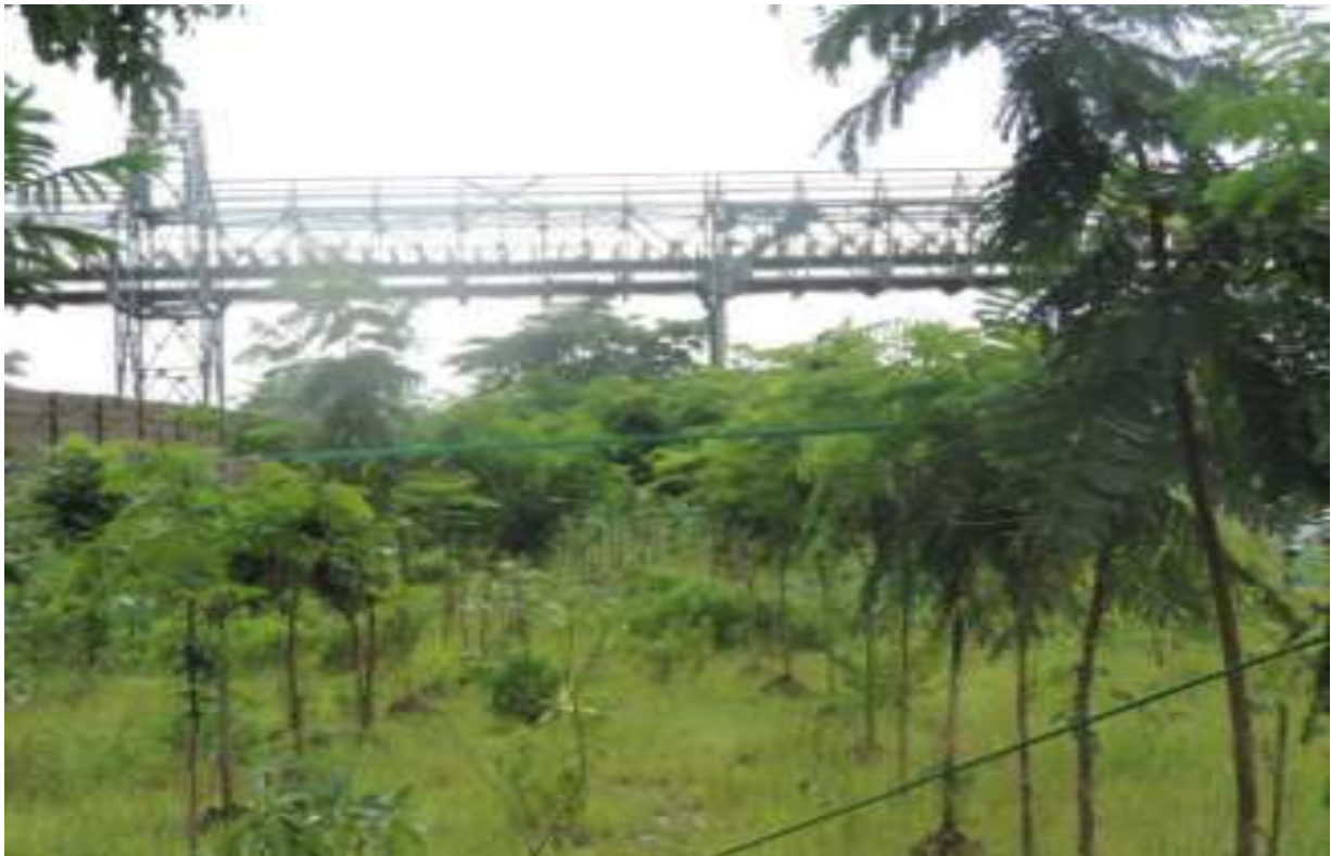
A VIEW OF GREEN BELT OUTSIDE APPROACH ROAD