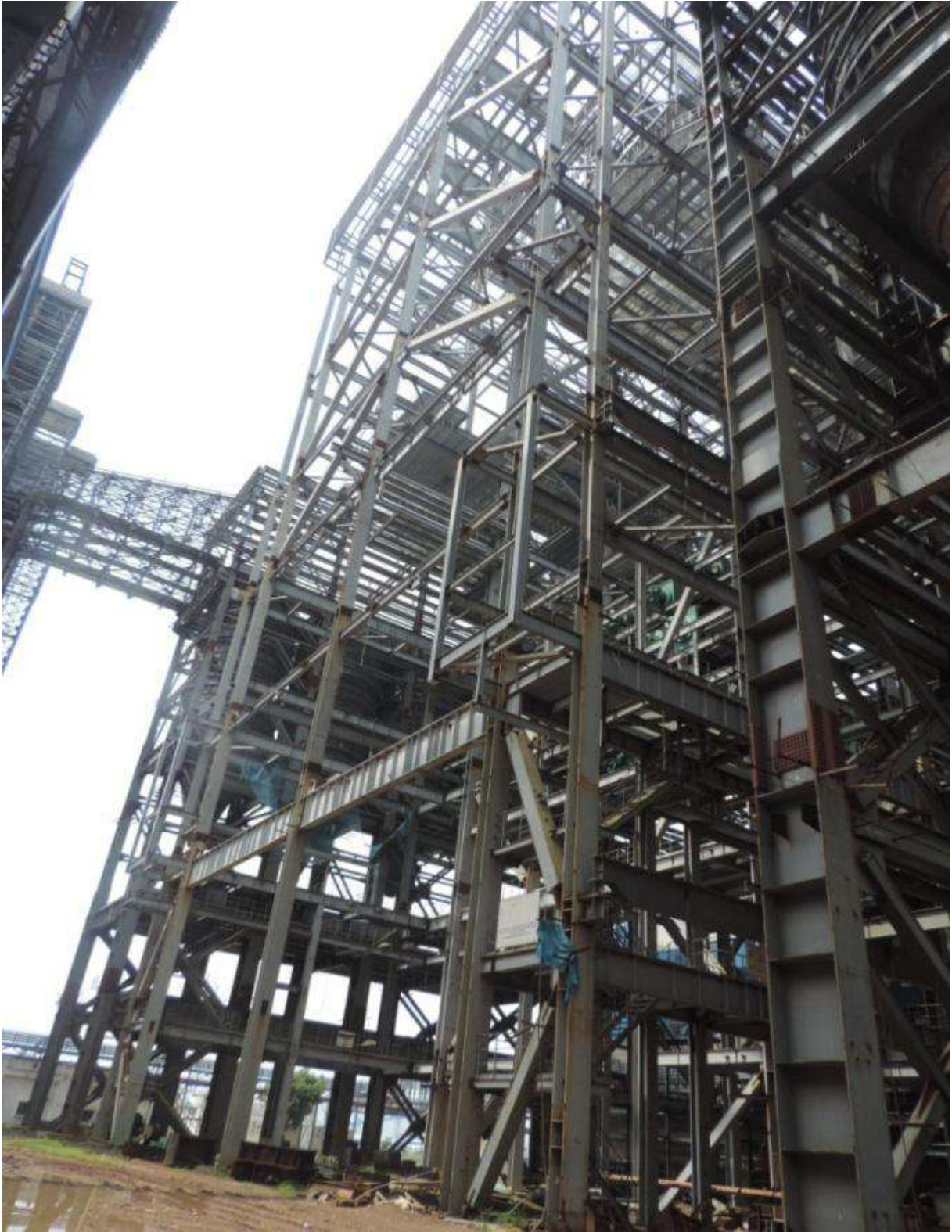
Boiler #2 – Erection of Structural steel & Platform is in progress