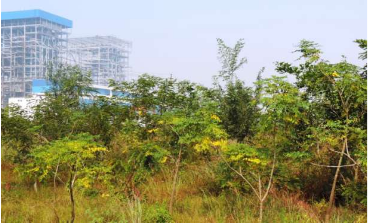
A VIEW OF GREEN BELT AT POWER BLOCK AREA