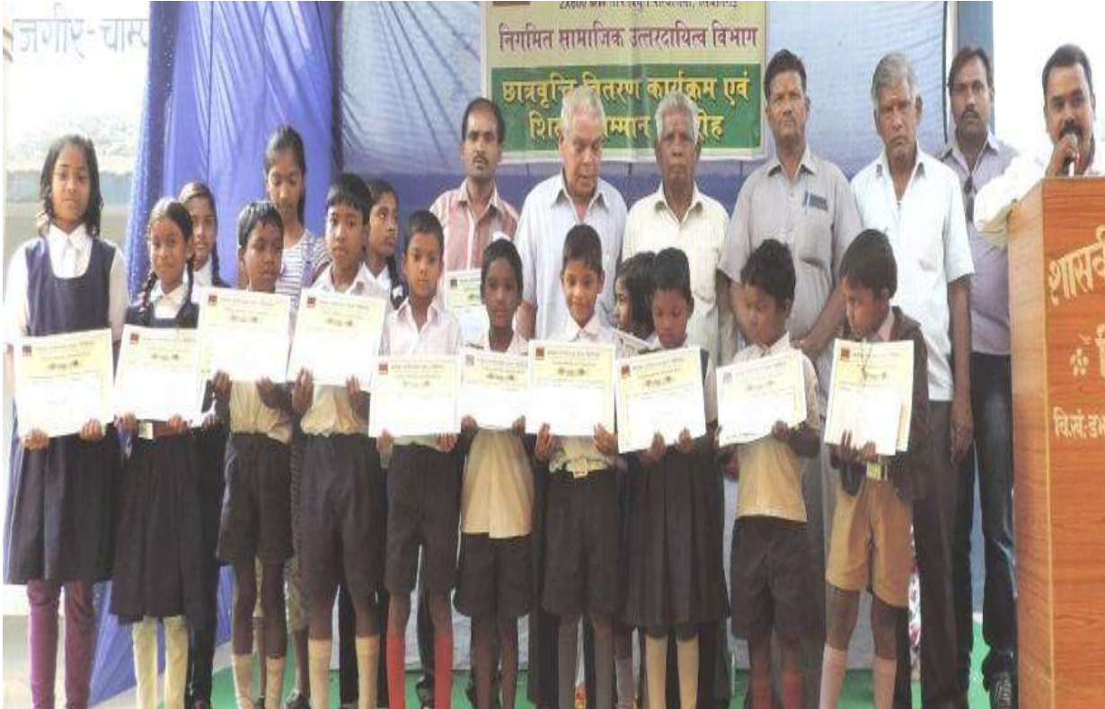
Meritorious Scholarship Distribution to Students