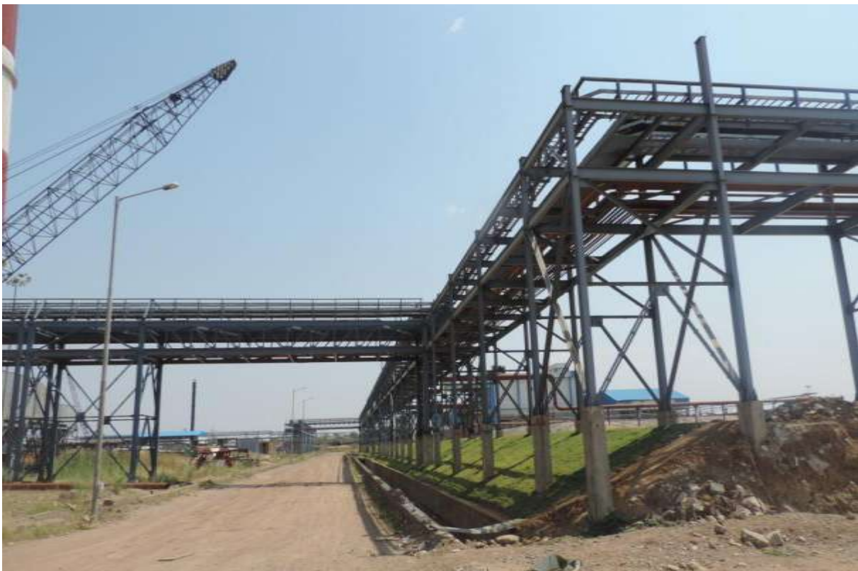
Pipe rack - Fabrication/Erection of Support Structure