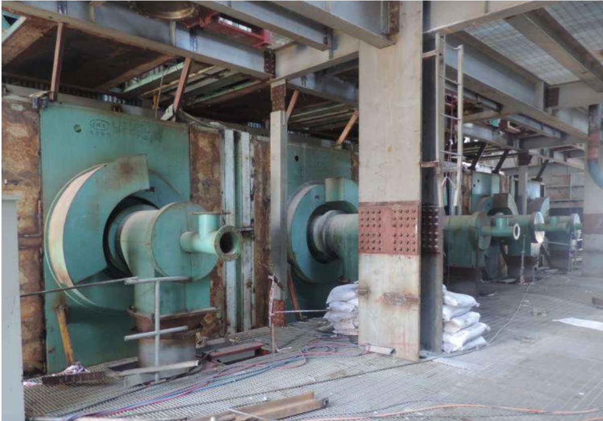
Boiler #1 - Refractory work under progress