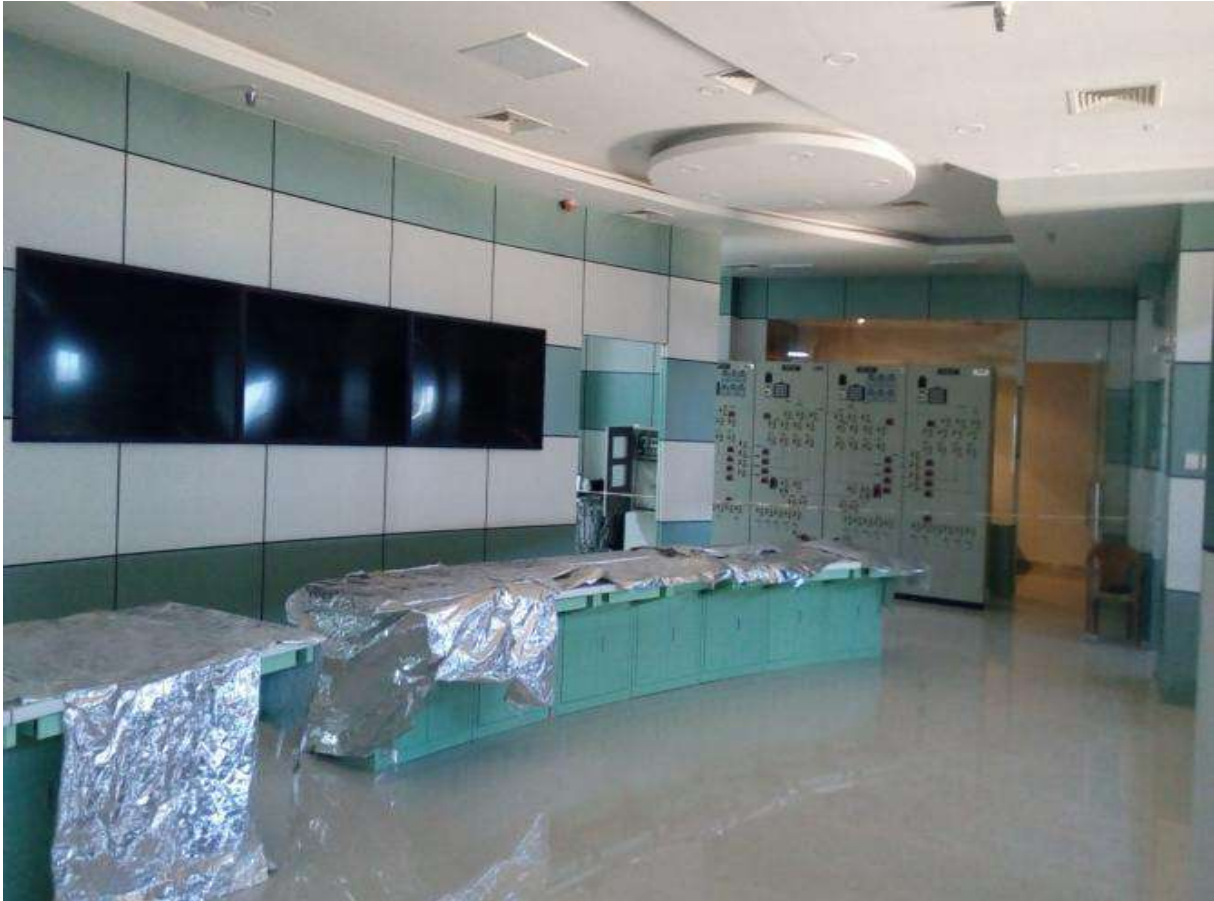
PHB – CCR Tiles Fixing & False ceiling works are completed