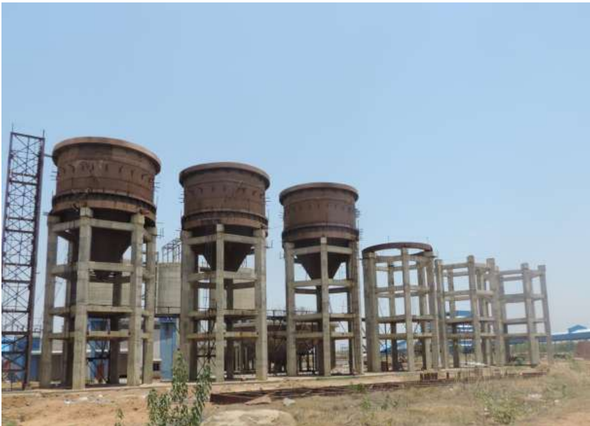
Hydro bins – Fabrication & Erection of structure in progress