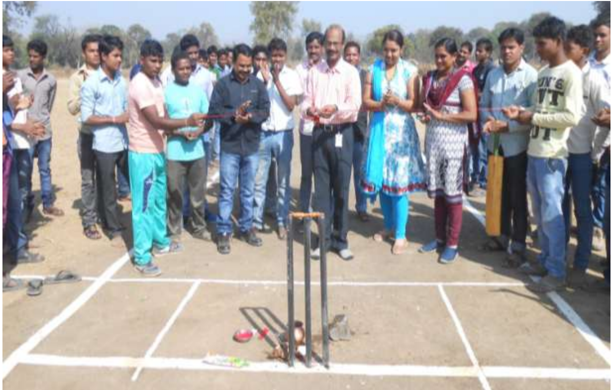
Provided support for Cricket Tournament