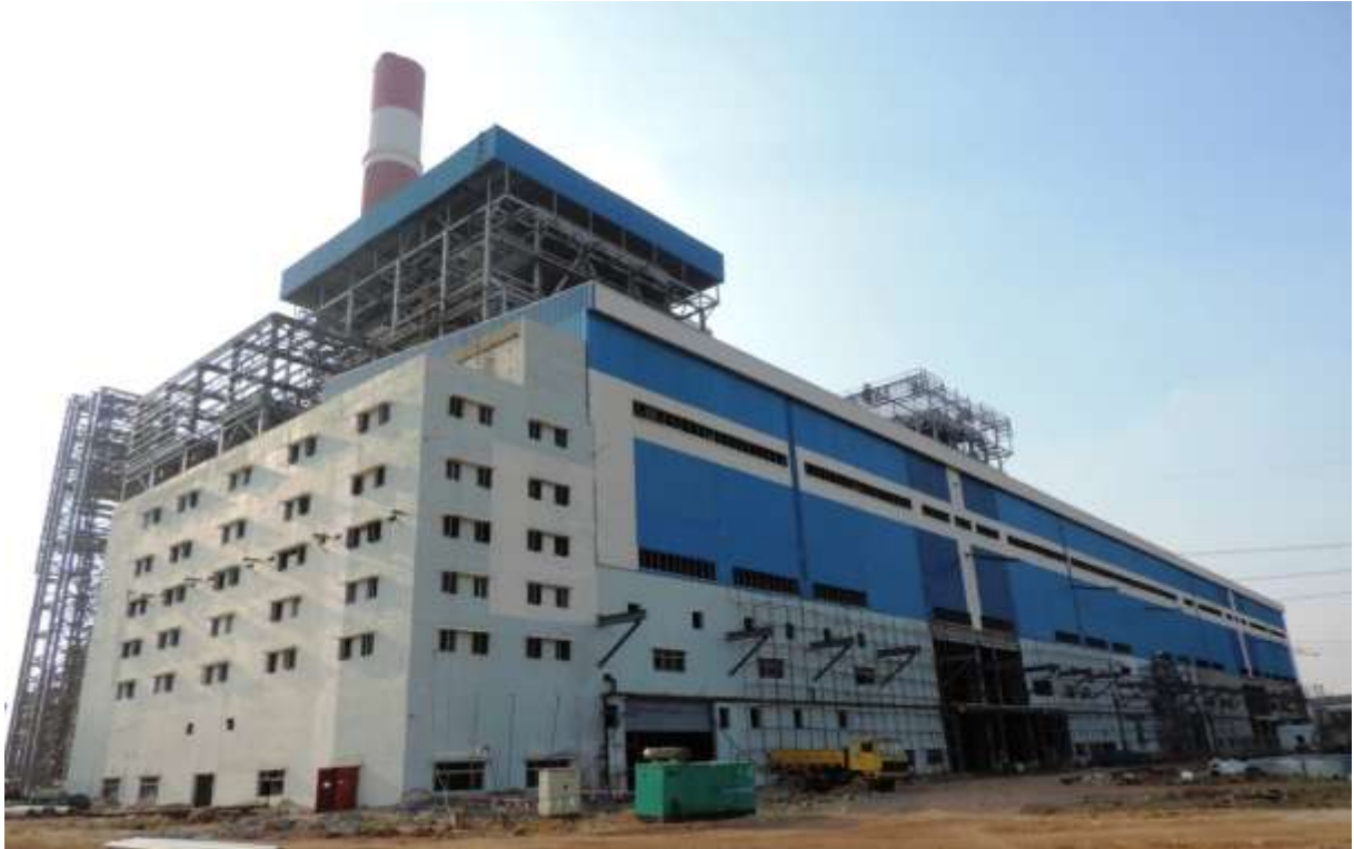
PHB #1 – Civil, Mechanical, Electrical, C & I works in progress