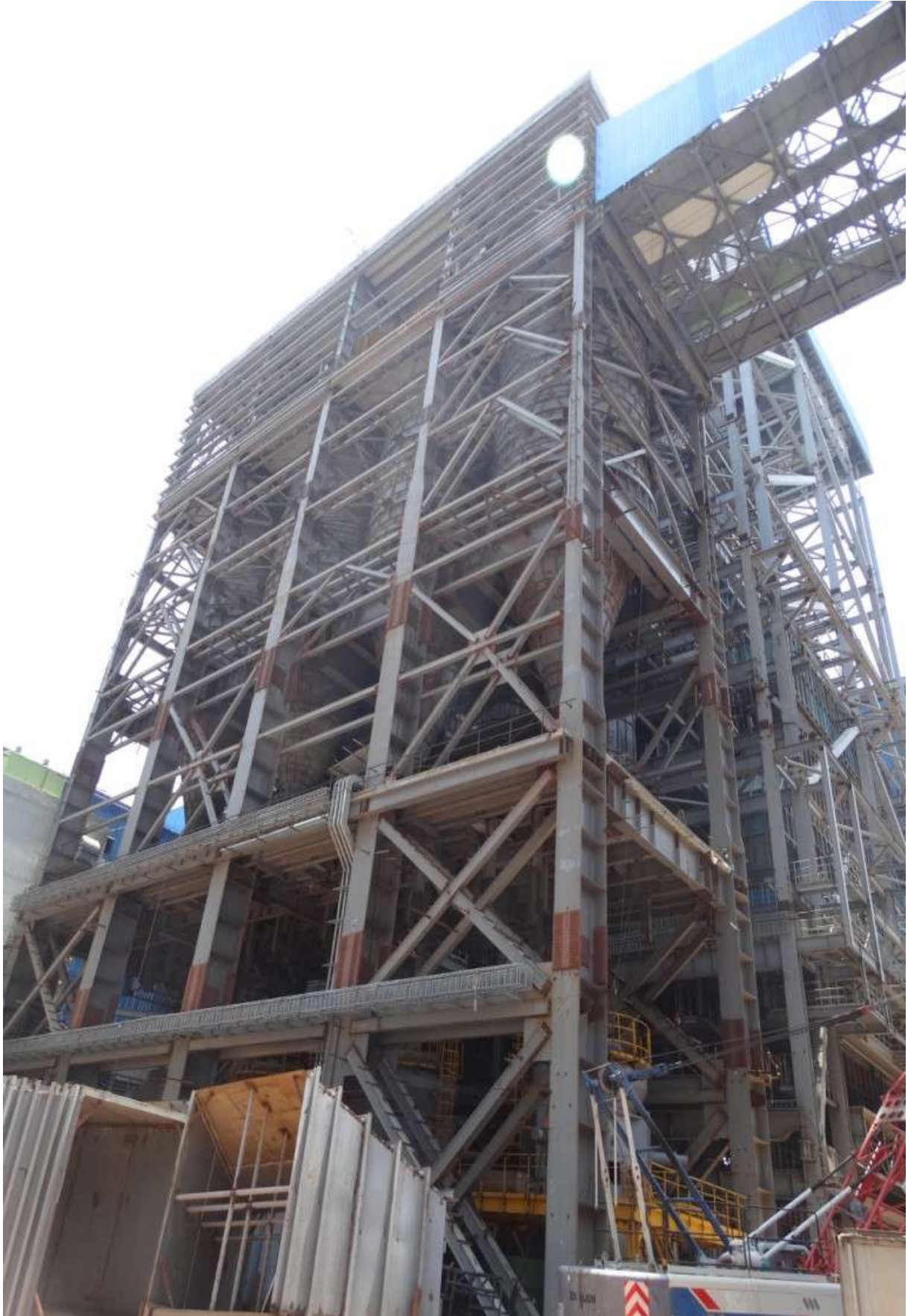
Bunker # 1B– Hopper S.S Liner plate erection and welding in progress