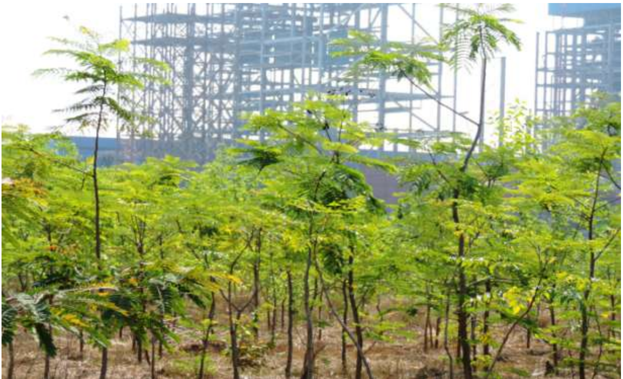
A VIEW OF GREEN BELT AT POWER BLOCK AREA