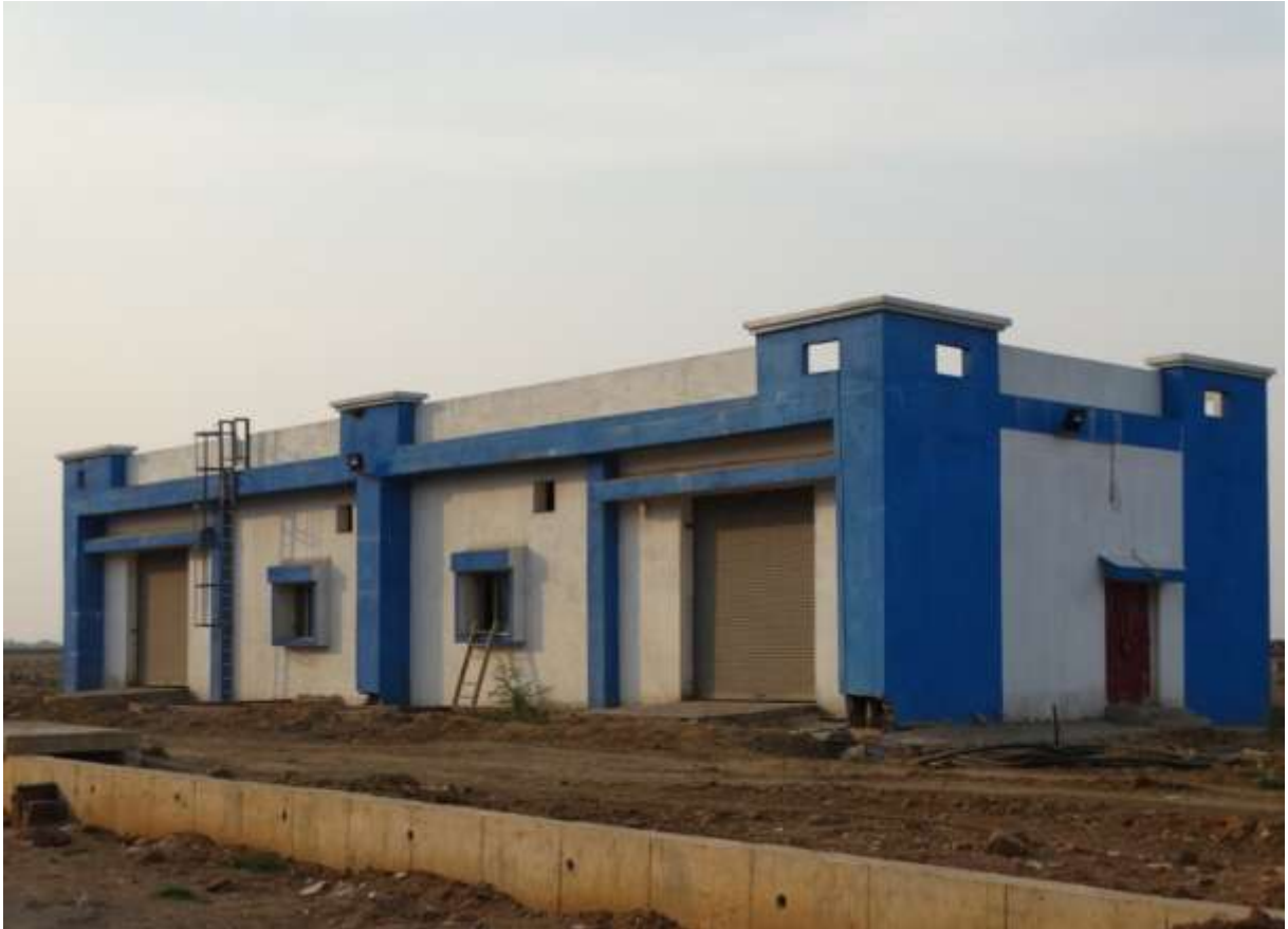
Track Hopper MCC - Cable termination works in progress