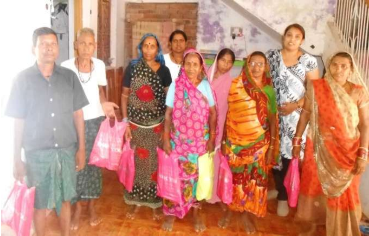
Sanitation Awareness Program and Kit Distribution