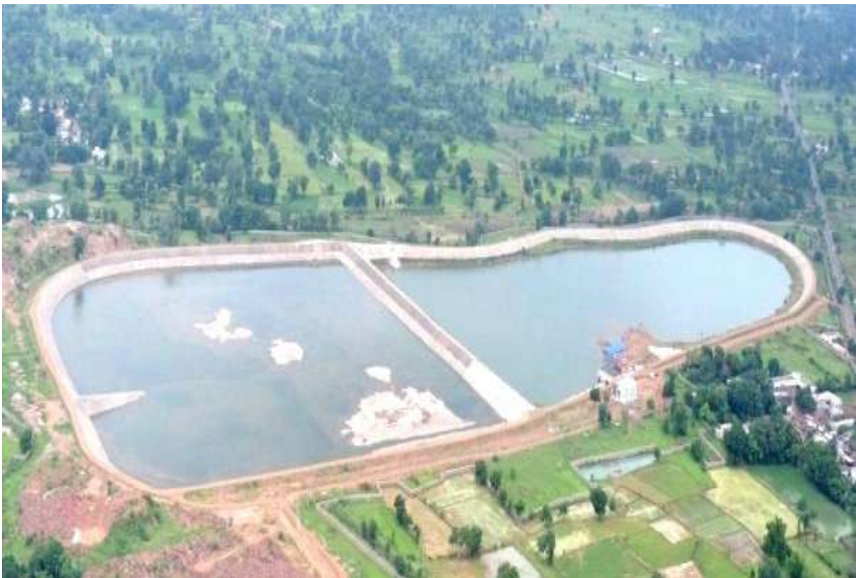
Raw water Reservoir - All works completed