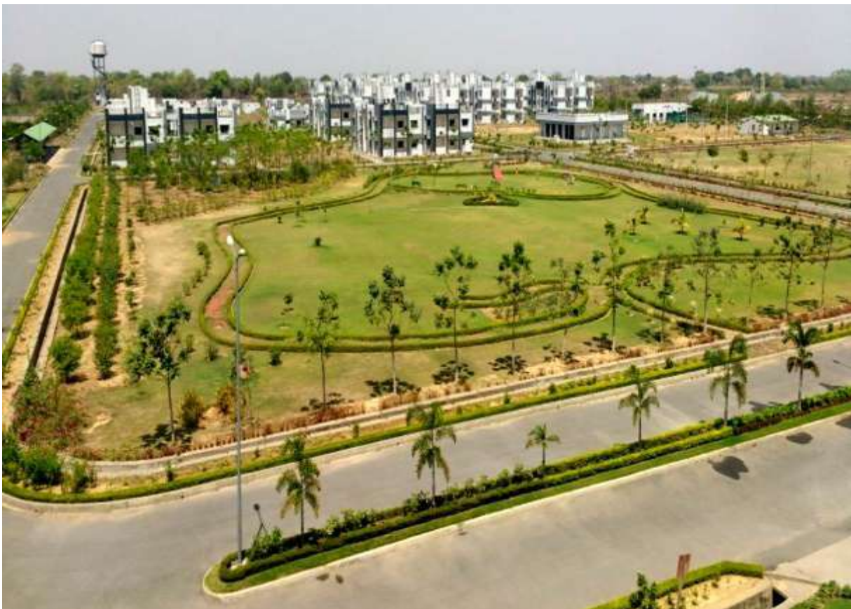
Residential Colony – Completed