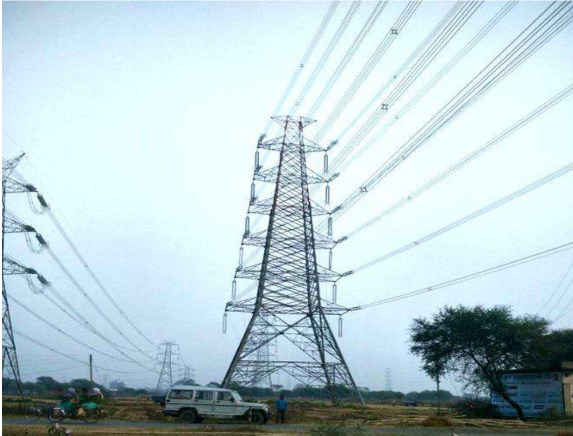
400kV Transmission Line Charged