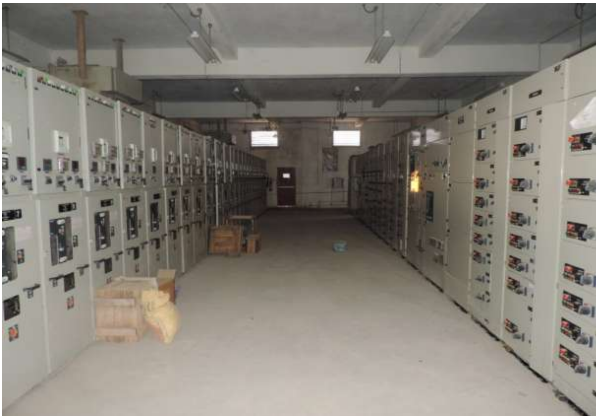
CHP MCC - Cable laying and termination works under progress