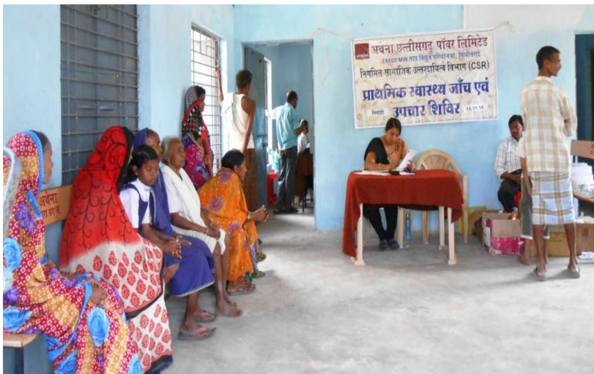
Primary Health Check-up and Treatment Camps