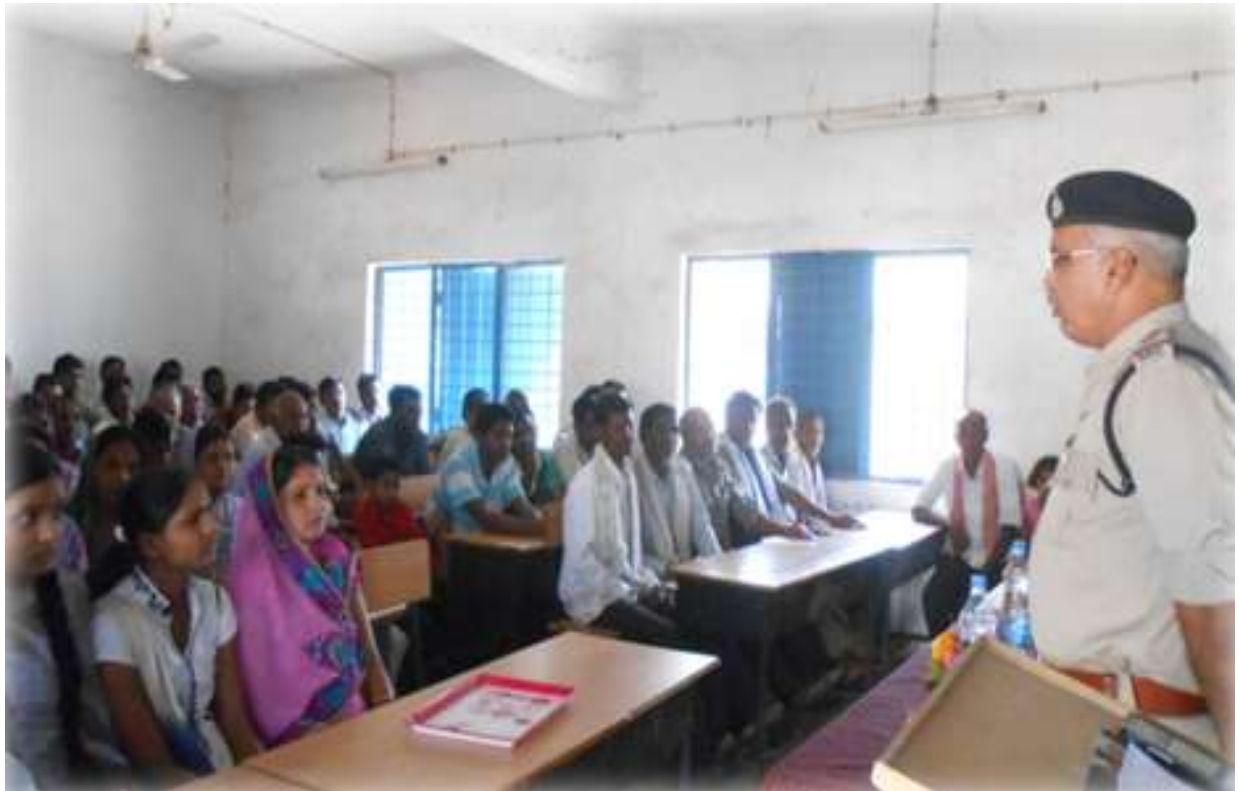
Legal Literacy Awareness Program