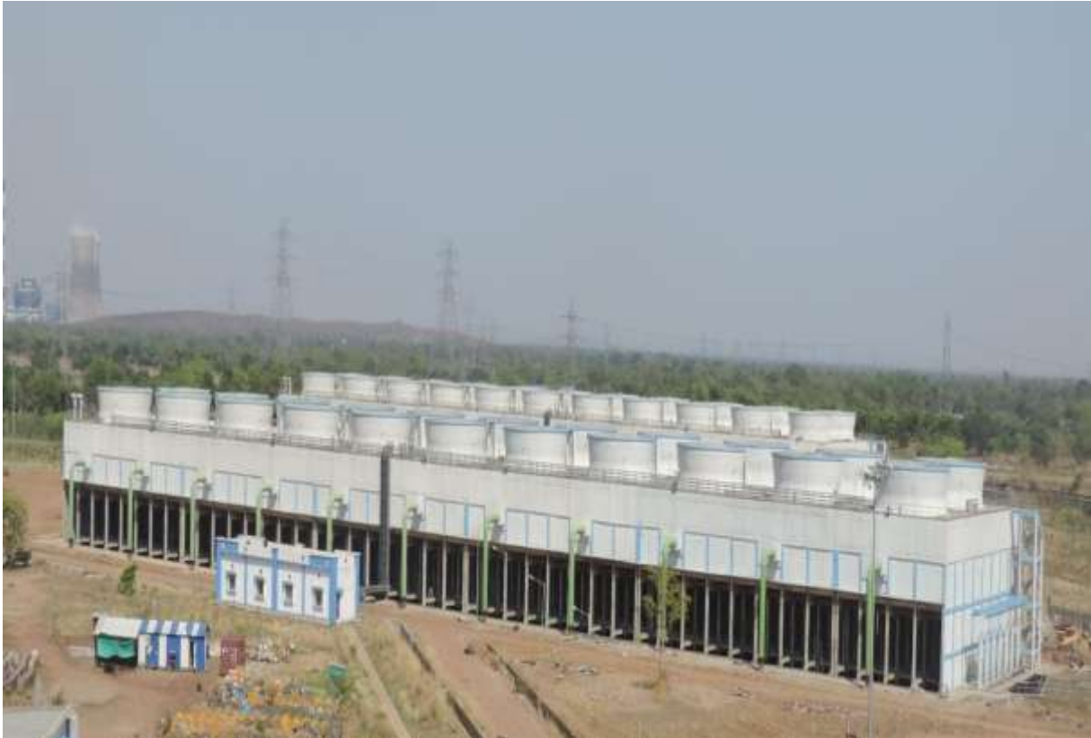
IDCT # 1&2 - Tip Clearance 5 /22 completed