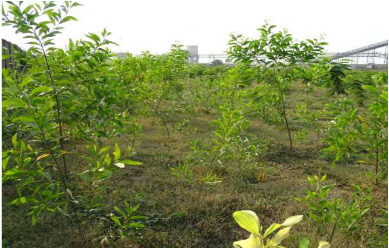
A VIEW OF GREEN BELT AT CHP AREA