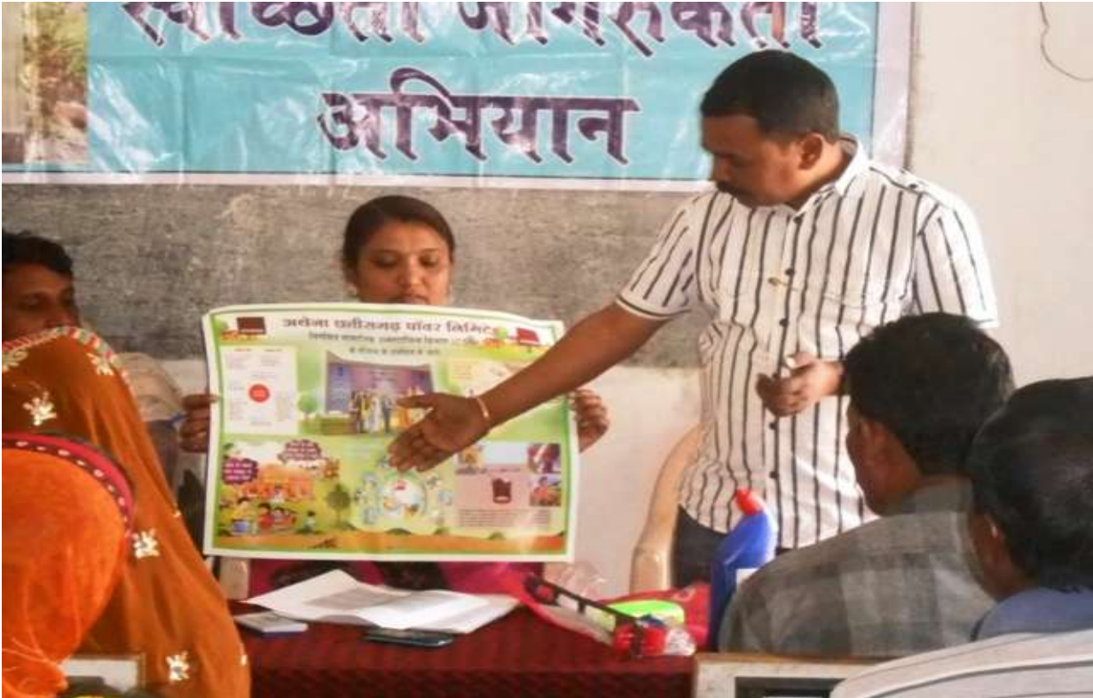
Sanitation Awareness Program and Kit Distribution