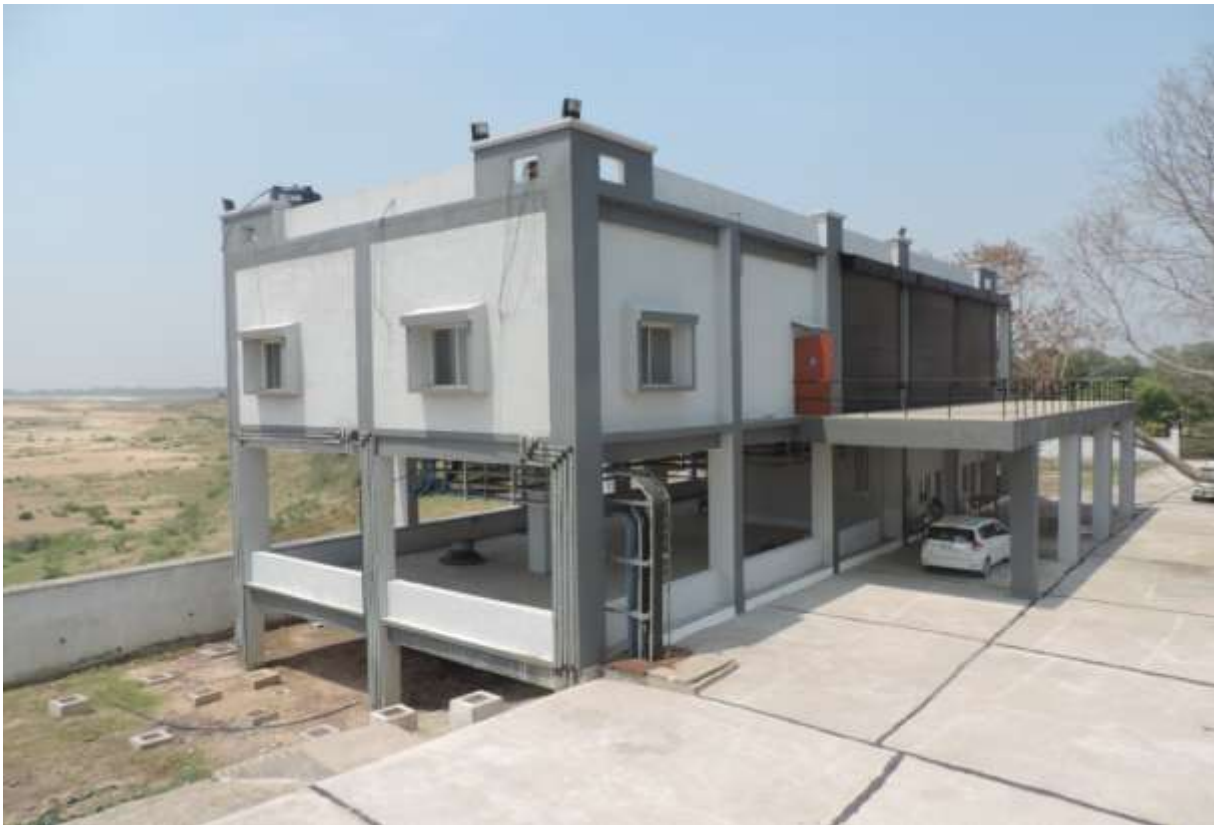
Electrical building at River end - PLC & UPS powered up completely