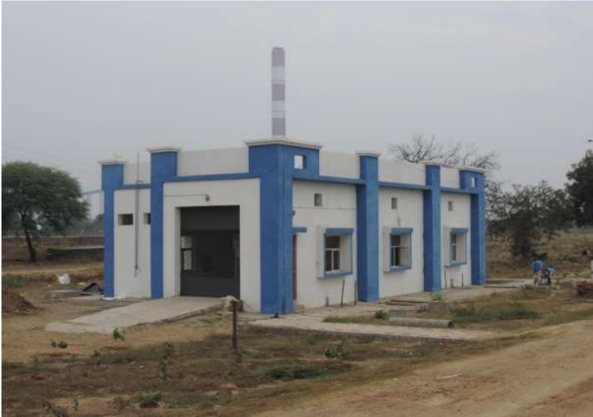
Raw water MCC Room - OFC laid from IDCT to Raw PLC