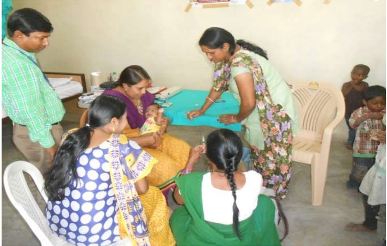
Immunization Program for Children and Pregnant Women