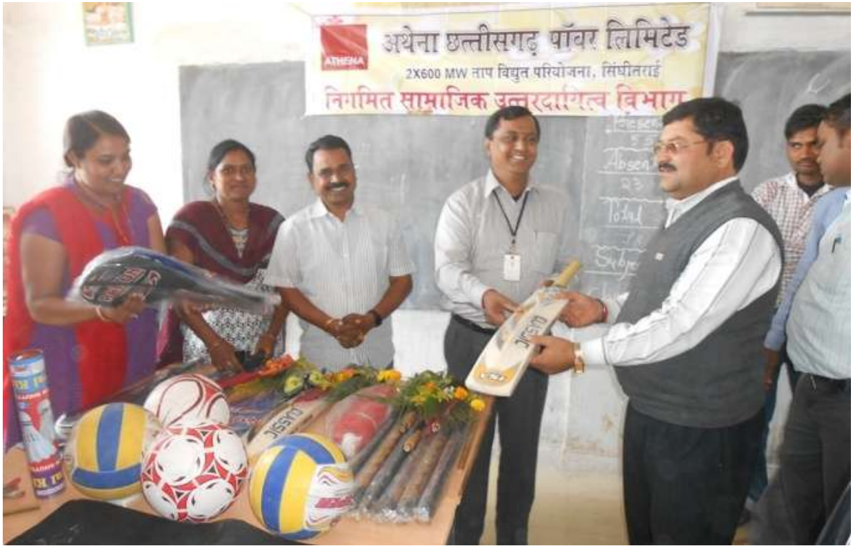
Sports Items Distributed to Govt. H.S.School Dhorkot