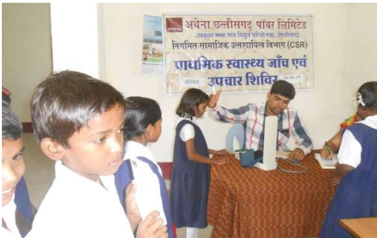
Health Check-up of school children