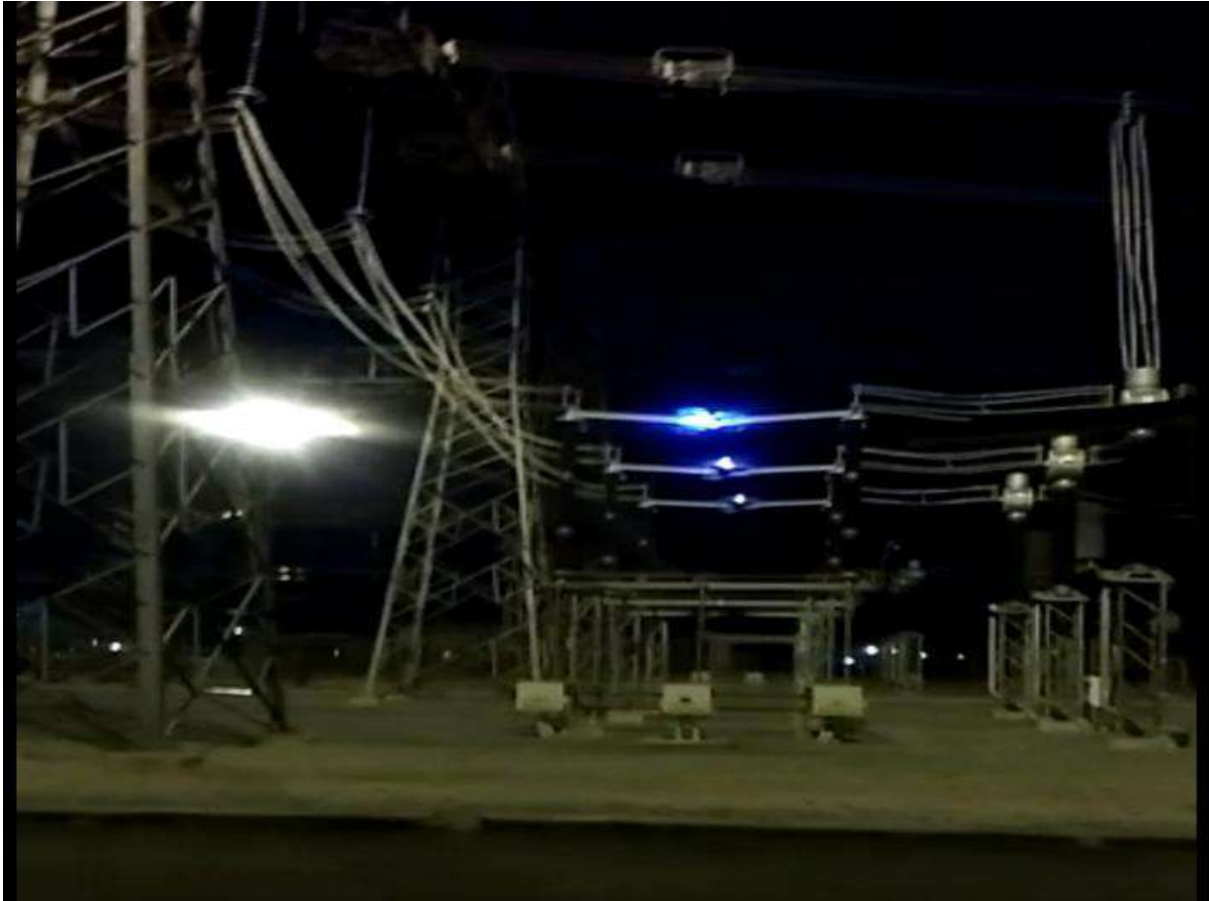
Switchyard - Isolator closing Arc