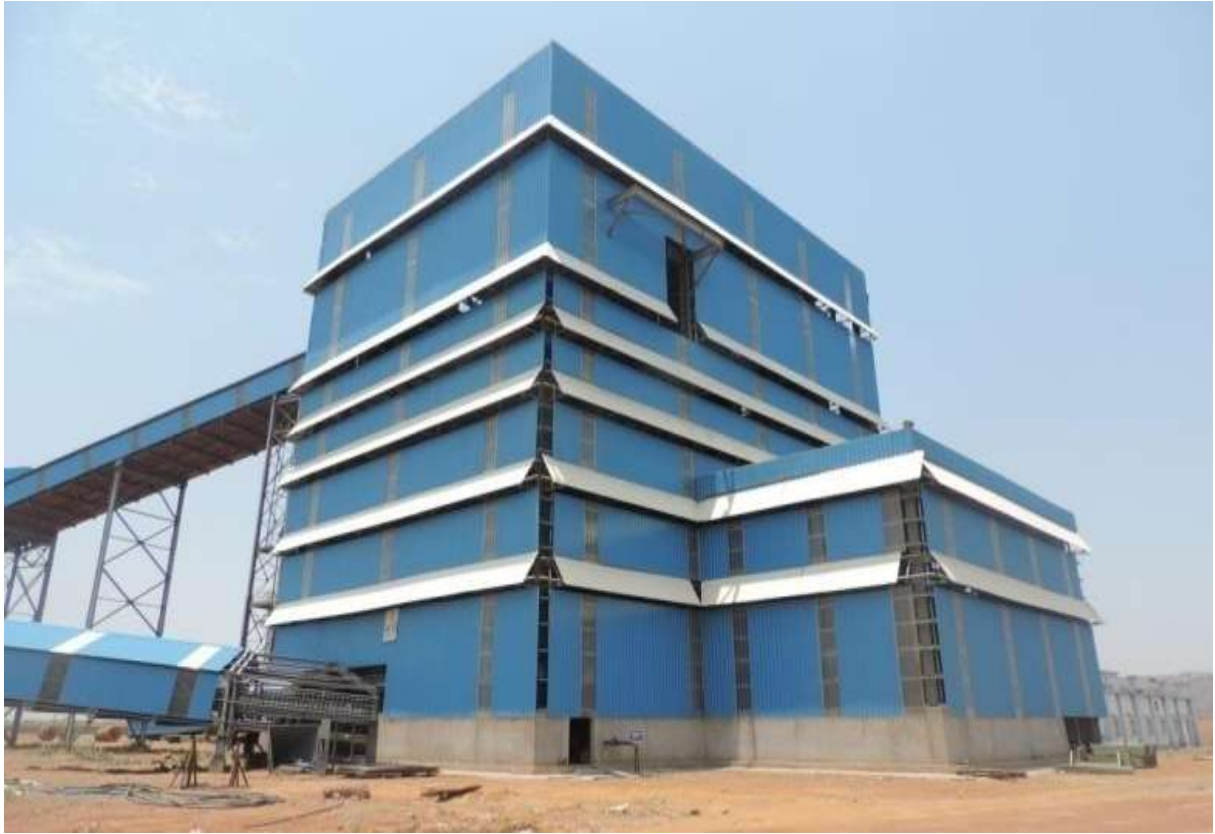
Crusher House - Cladding works in progress