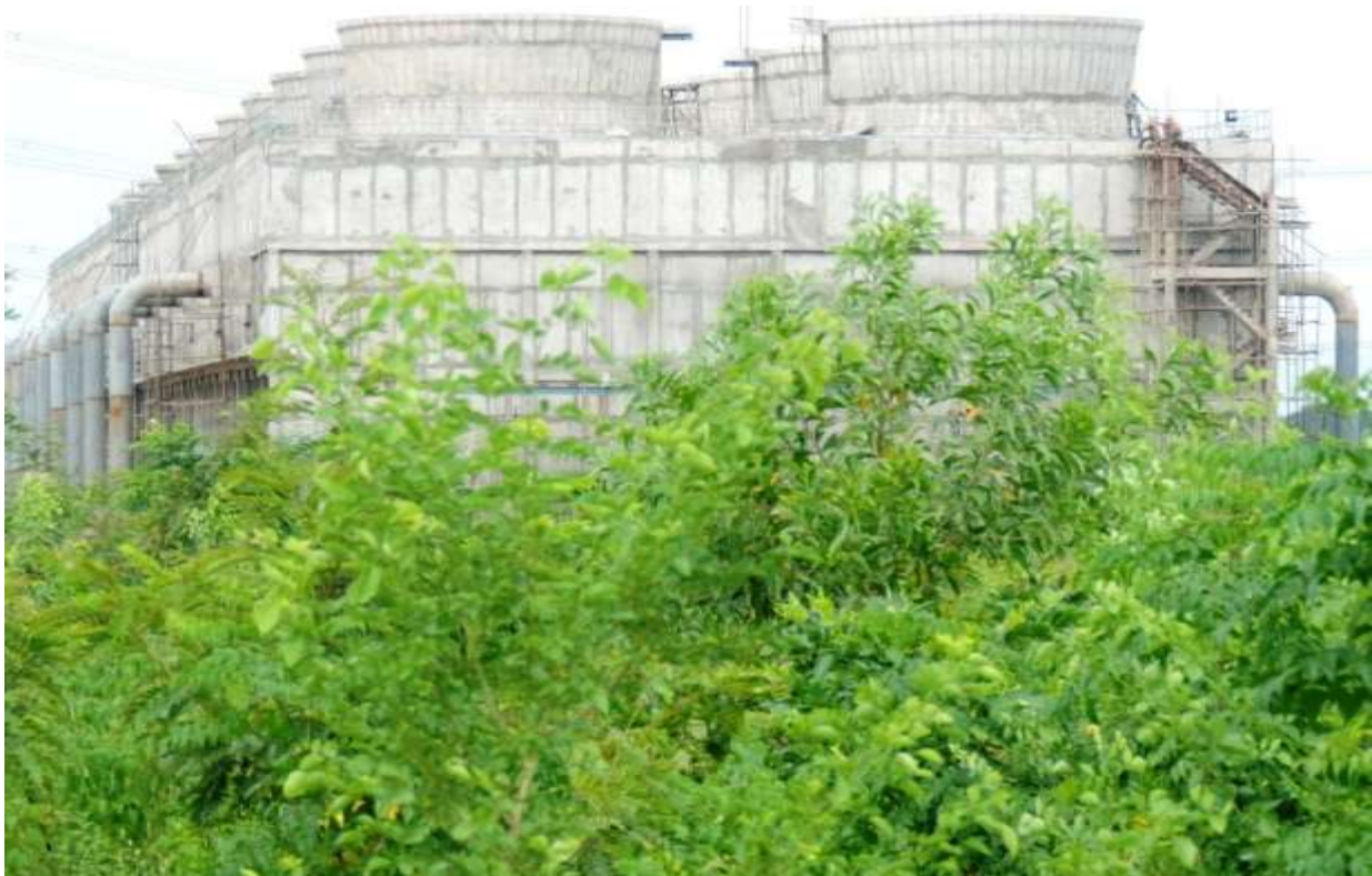
A VIEW OF GREEN BELT AT POWER BLOCK AREA