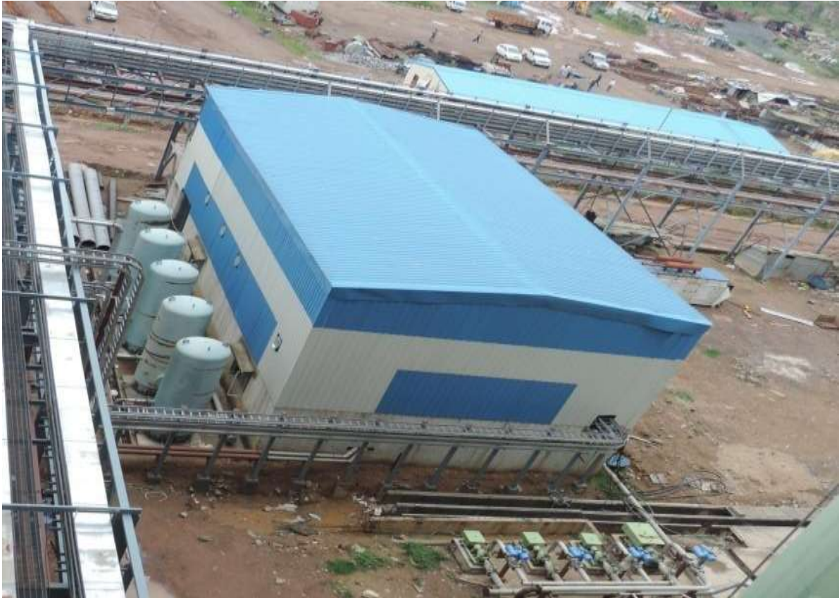
Compressor House – Pipe Line welding in progress