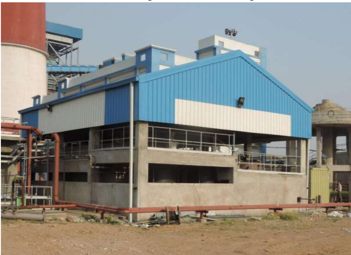
Effluent treatment plant - Cable laying and termination completed.