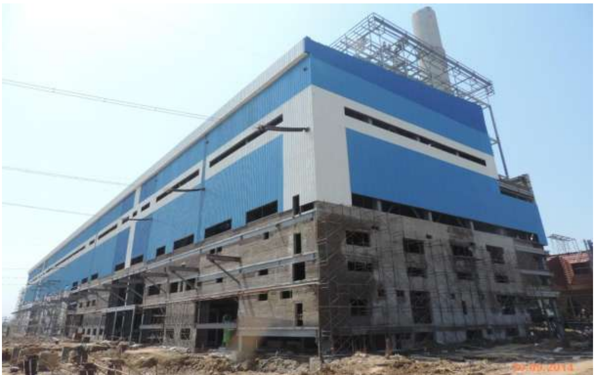
PHB #2 – Brick Works and Plastering Works are in Progress