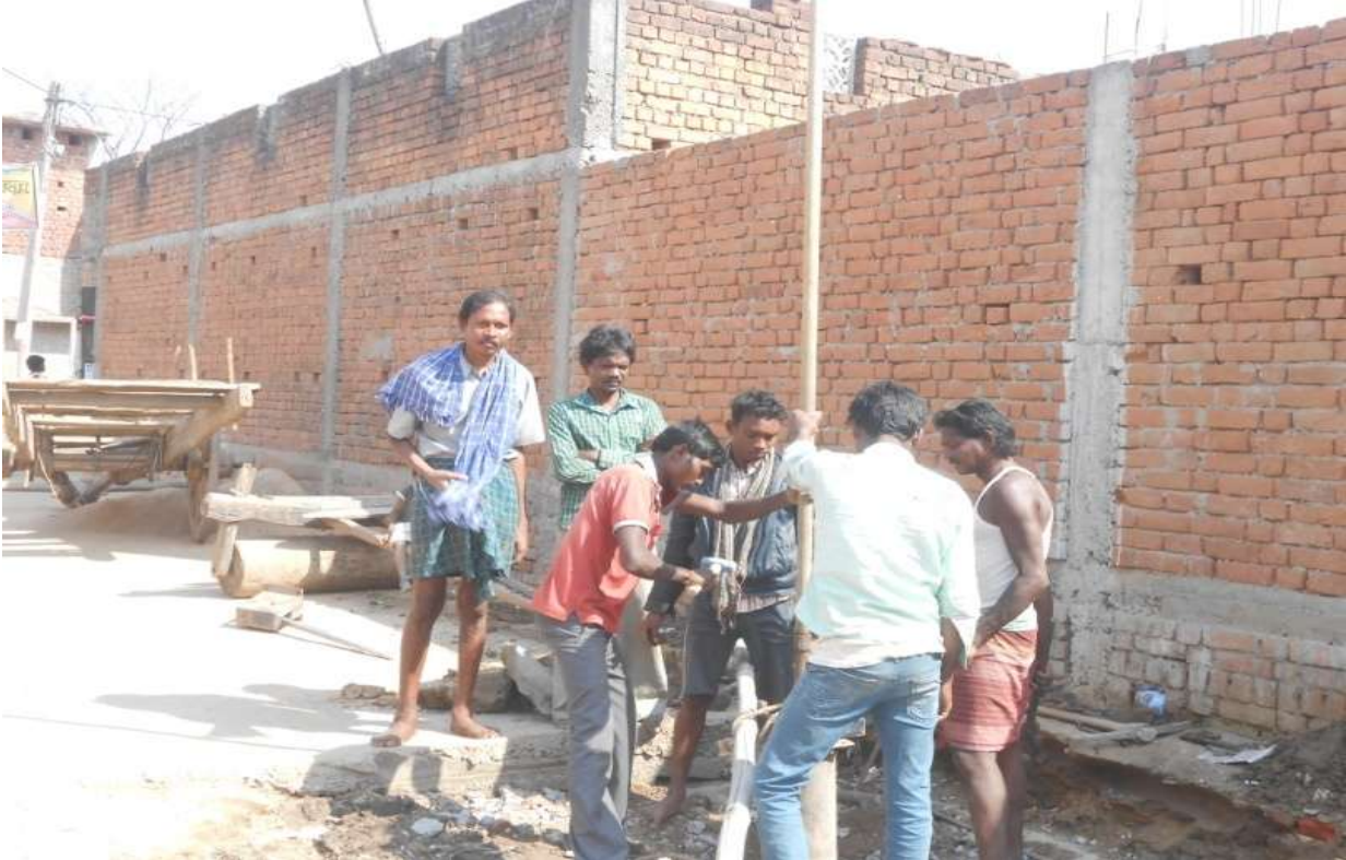
Hand Pump Repaired