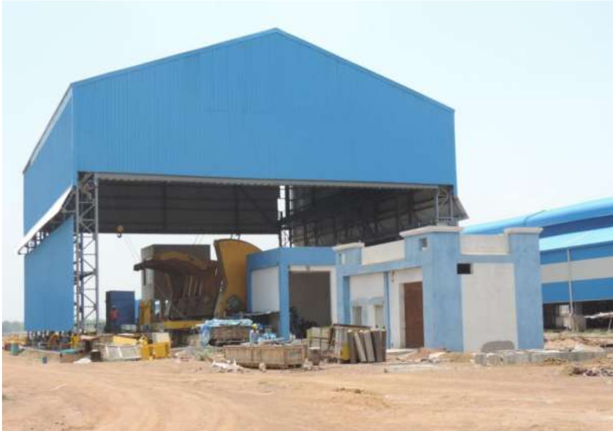
Wagon Tippler – Cable laying is in progress.