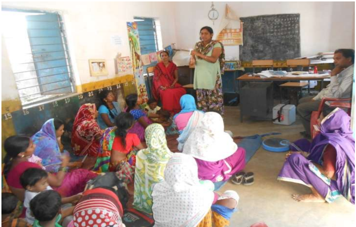
Parents meeting and Health Awareness Program