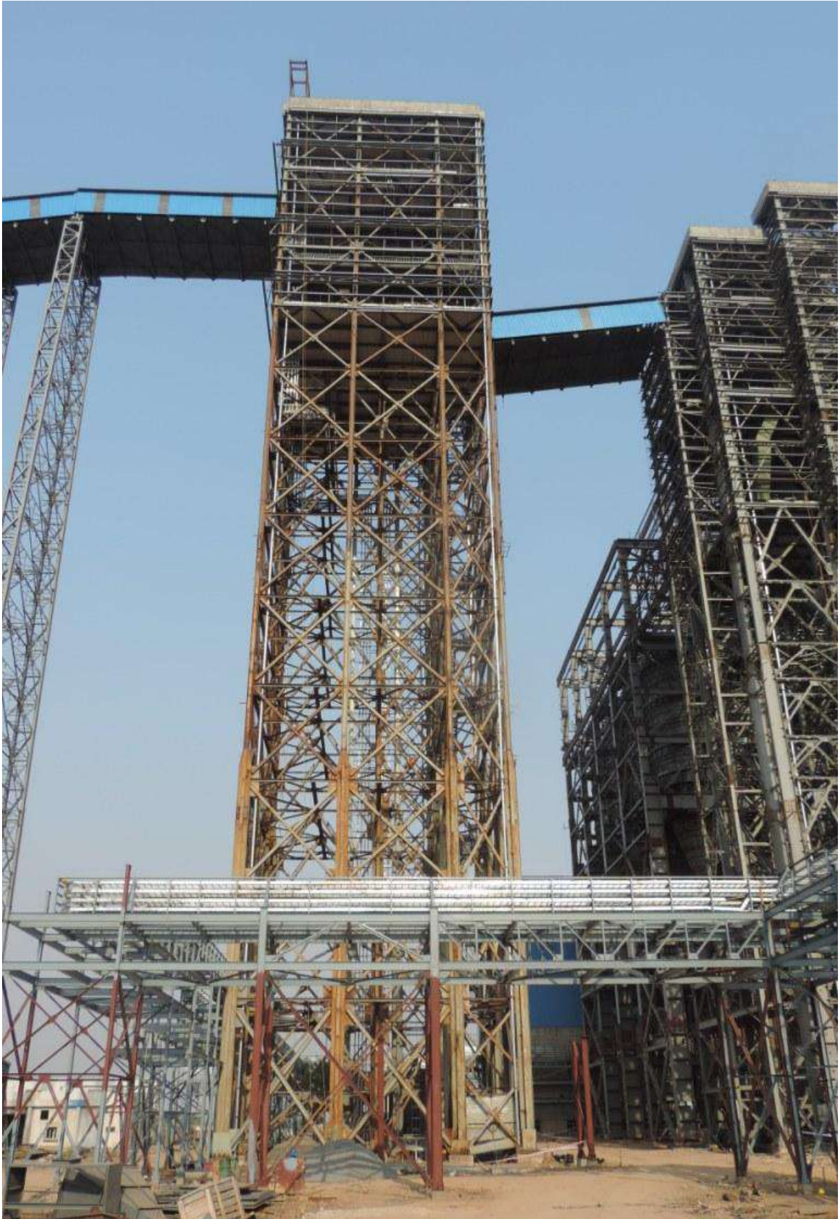
TP #5 – Erection of floor beam & Staircase is in progress