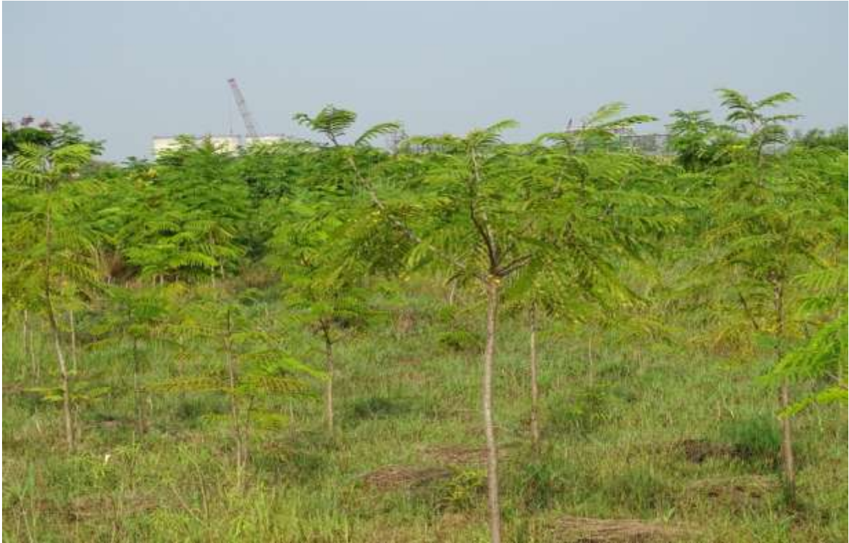
A VIEW OF GREEN BELT AT POWER BLOCK AREA