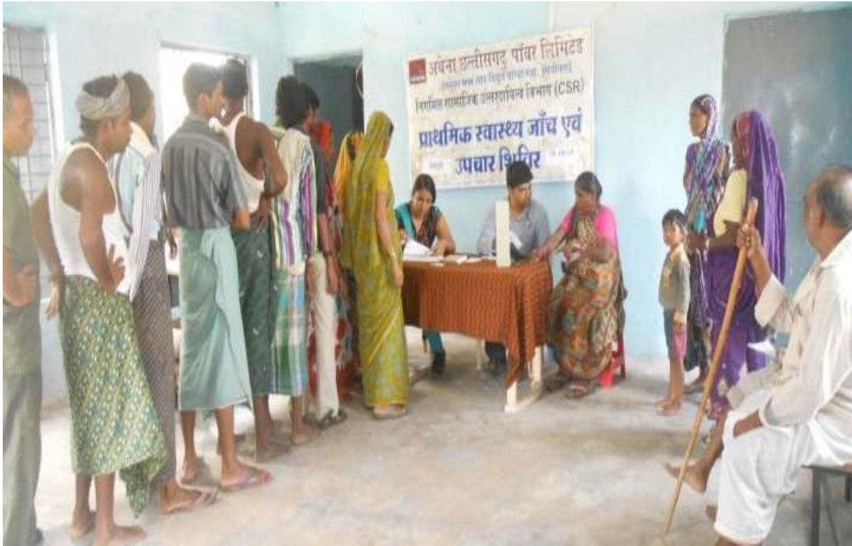
Primary Health Check-up and Treatment Camps