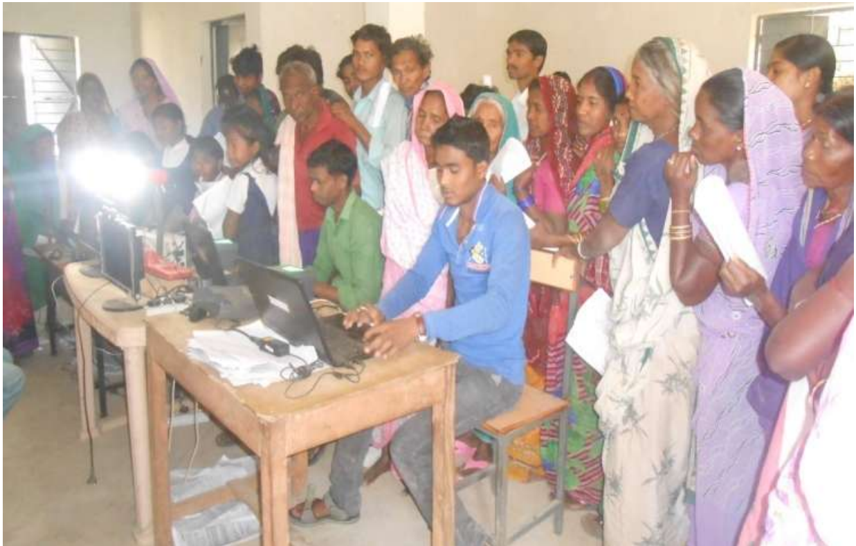
Provided Support for Registering of AADHAR CARD