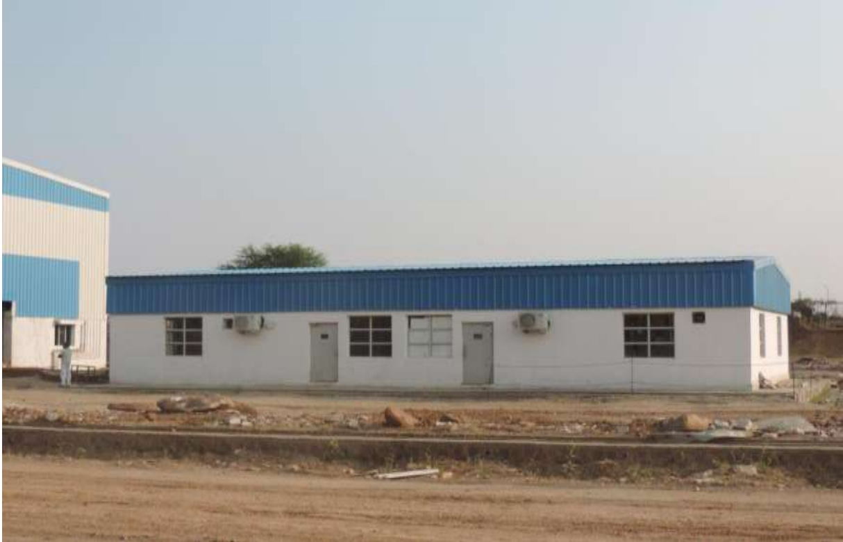
E & M building – All works completed