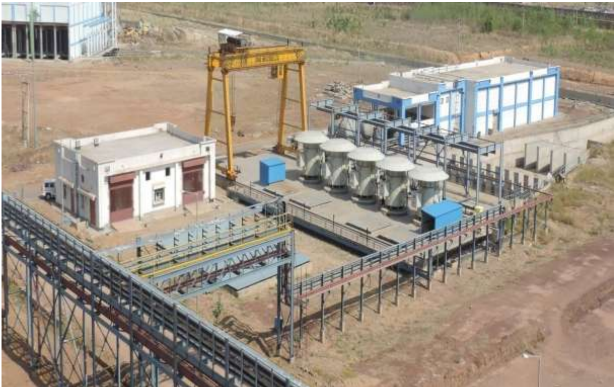
CW Pump house – Cable laying is in progress