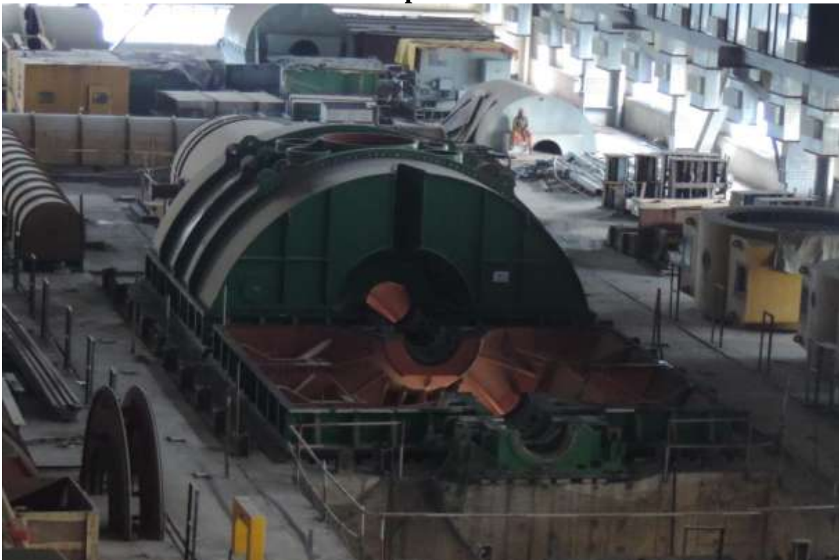
TG #2 – LP Turbine Temporary placement of lower & upper outer casings are completed