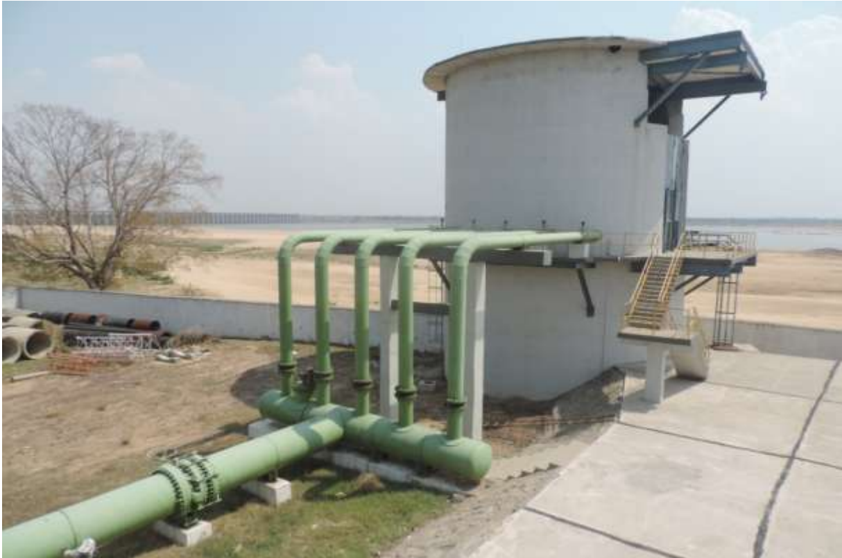
River water Intake pump house – All Major equipment erection completed