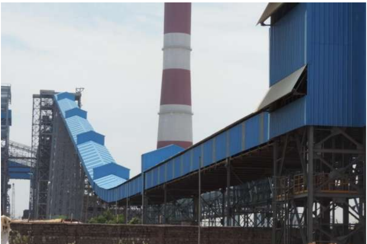
BCN 6A/6B – Lighting works are completed