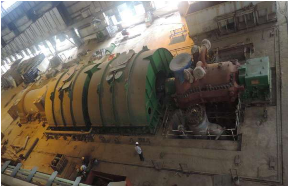
TG #1 - HIP Turbine Temporary Box up & Generator rotor insertion completed.