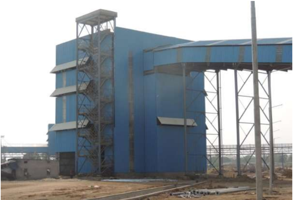
TP # 3 – Drive unit erection in progress and alignment is in progress