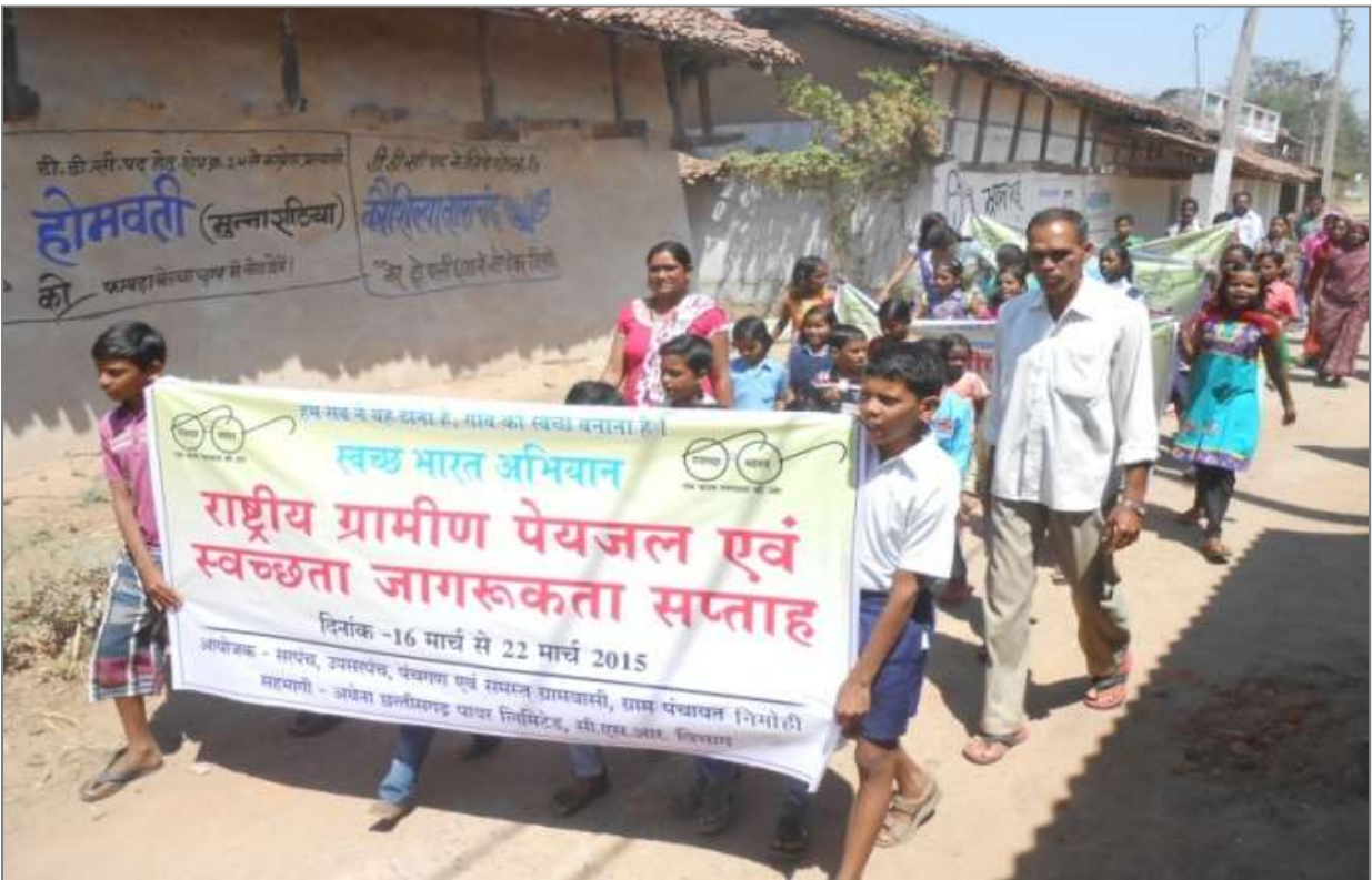
Sanitation Awareness Rally