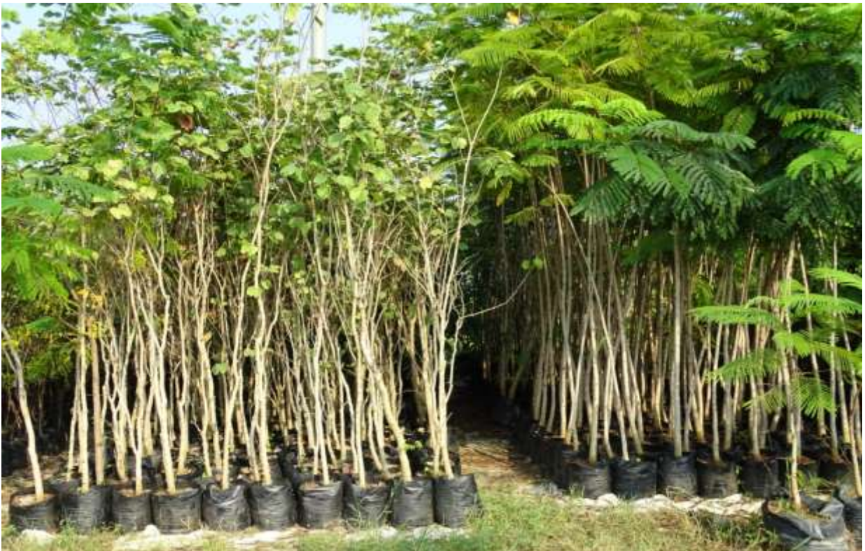
VIEW OF NURSERY AT PROJECT SITE