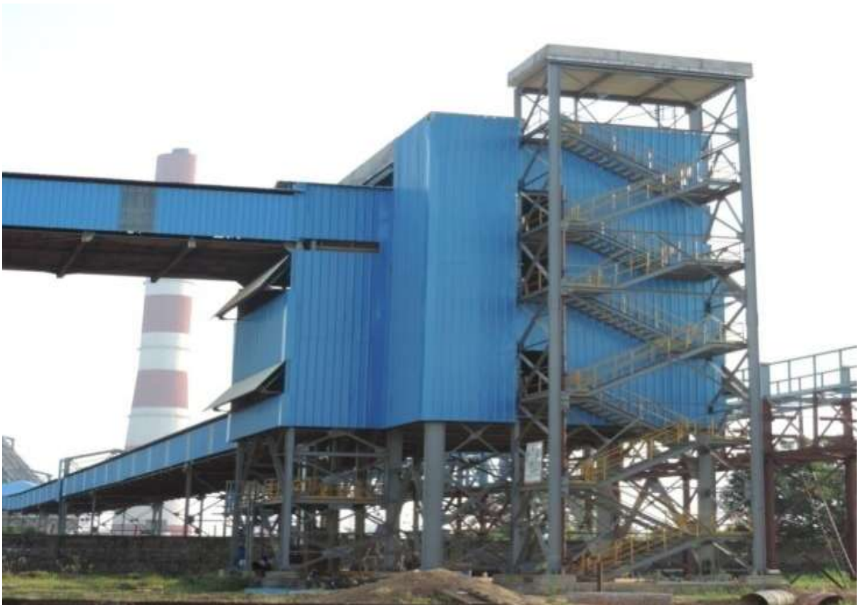
TP #4 – Chute erection completed