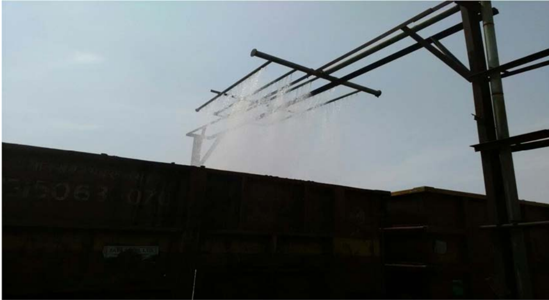
Figure 1. : Water Spray System on Open Rail Wagons