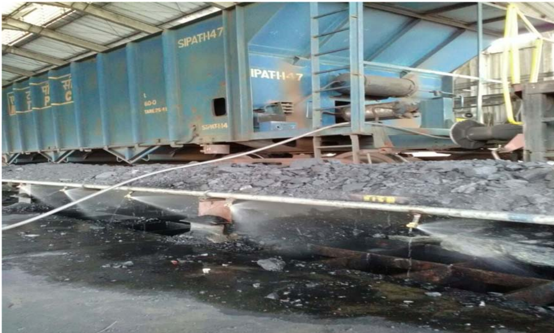
Figure 2. : Water Sprinkling System at Coal Unloading Areas at Sipat STPP