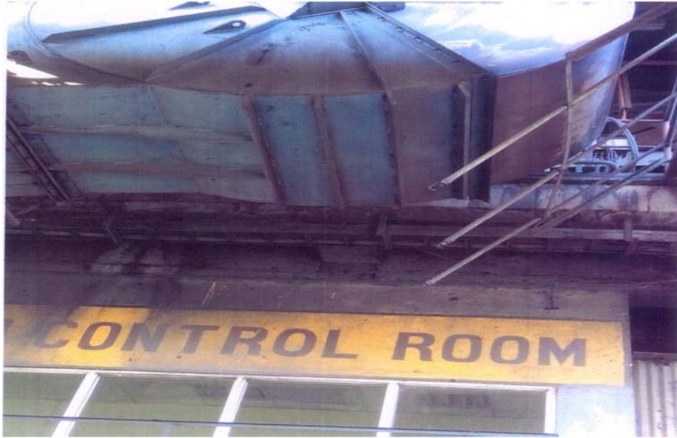
Figure 3. : Water Spray System at Loading Site