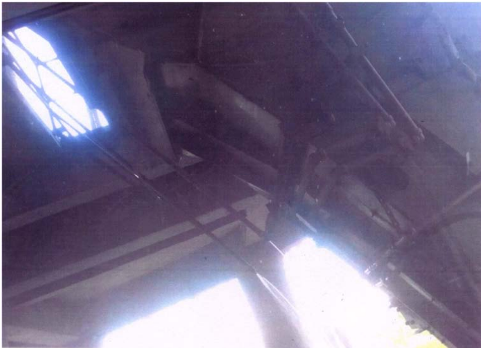
Figure 4. : Water Spray at Loading Site