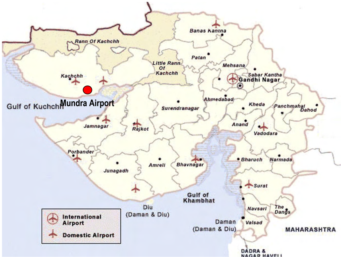
Figure 1-1: Airports in Gujarat

Chapter 8: Analysis of Proposal (Financial & social benefits to the locals) - This chapter summarizes the CSR activities undertaken by APSEZ.