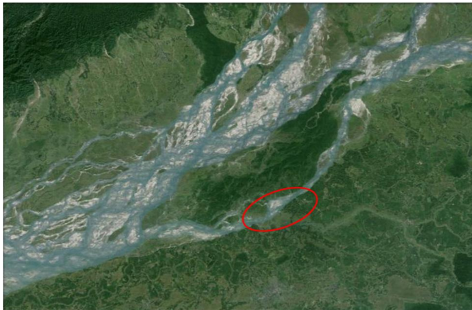
Physiographic map of Baghjan Area