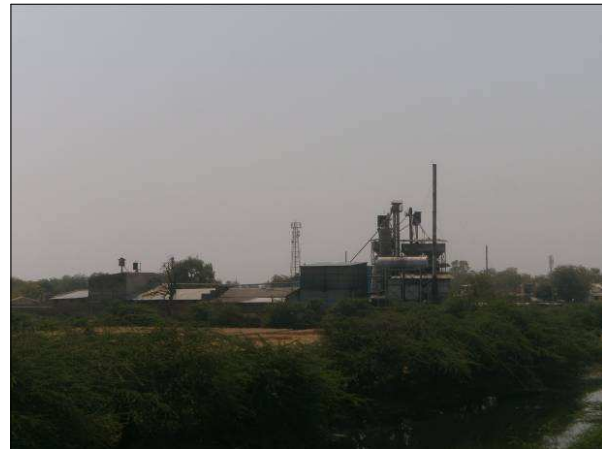
Figure -3: Photographs Showing the Industries Located Along the RoW