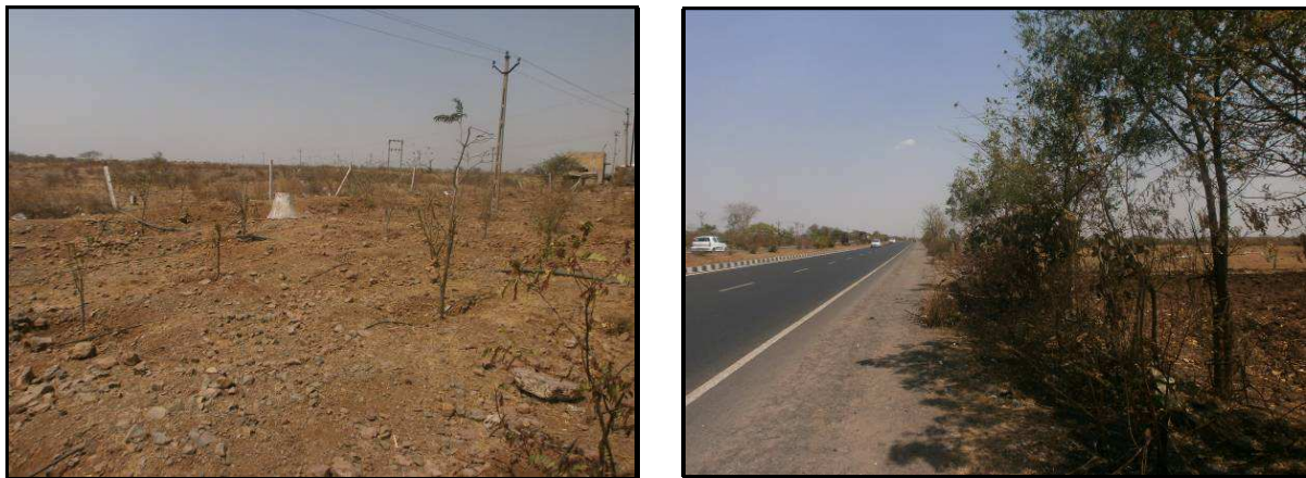
Figure -2: Protected Social Forestry along the RoW

Forest Stretch: It is learnt from the site visit and subsequent discussions had with the concerned Forests officials that the entire project stretch of 338 Km is passes through the Protected Social Forestry and apparently requires forest clearance as per the Forests (Conservation) Act, 1980 and subsequent amendments thereof. The photographs showing the protected social forest stretch in the RoW are given in Figure -2.