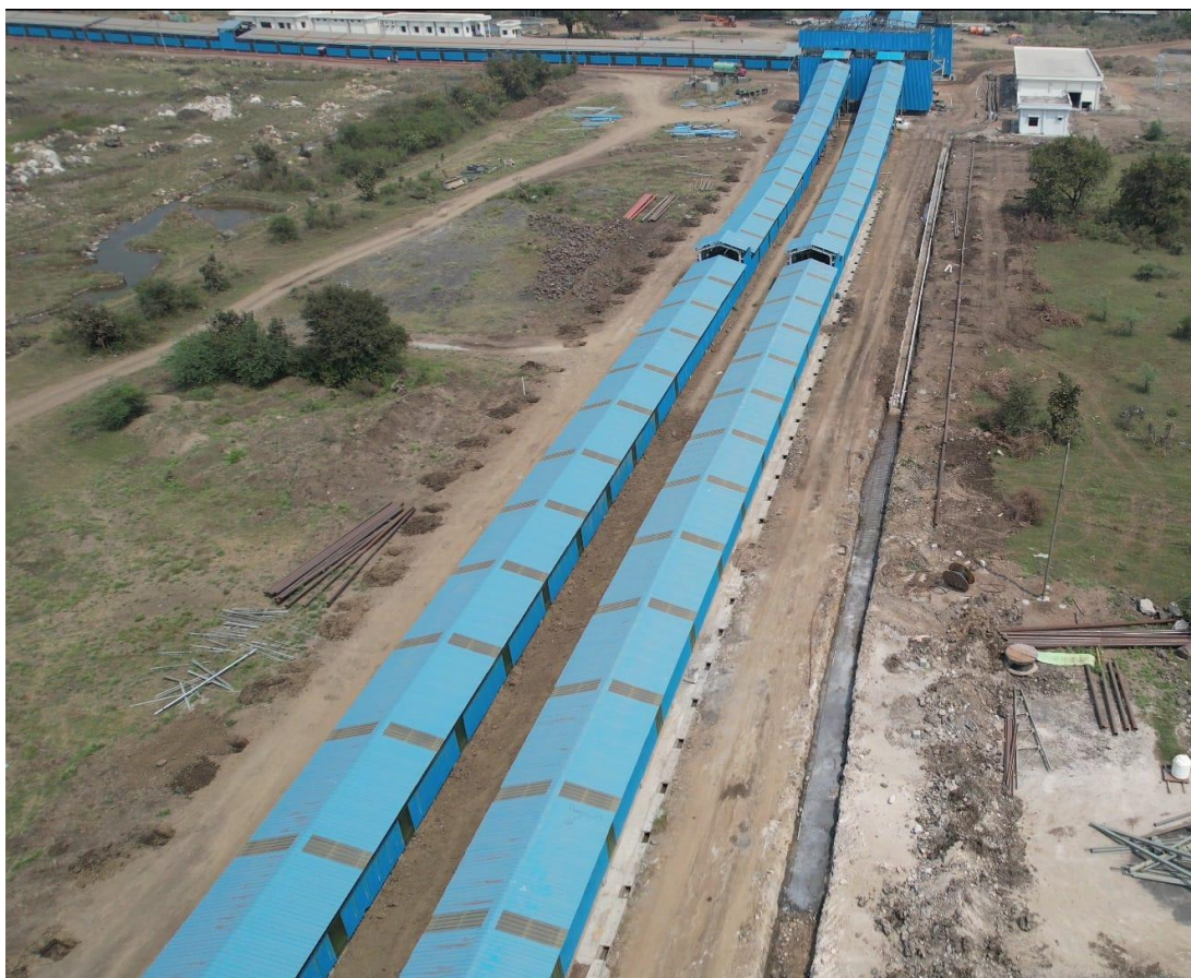
Figure 8 Closed Conveyor Belt Arrangement