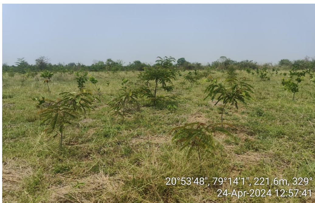
Figure 4 Plantation in Periphery of the Mine (Plantation done in 2022-23)