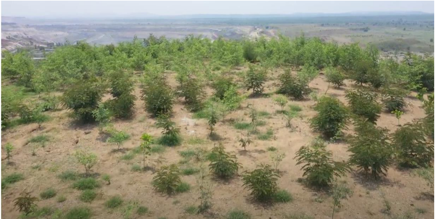
Figure 1 Plantation on top of OB Dump

It can be observed from the above graph, that the most of the plantation activities will be carried out from 2025-26 to 2027-28 after completion of OB dumping as envisaged in the Mining Plan.