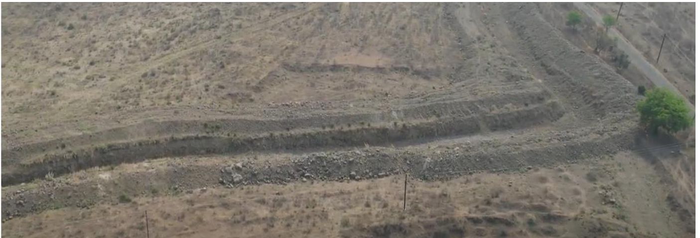
Figure 6 Garland Drain

The garland has been constructed for length of 7.6 Kms with depth of 1.8 km. The top width is 2.5 m and bottom width is 1.50 m of garland drain constructed in the project.