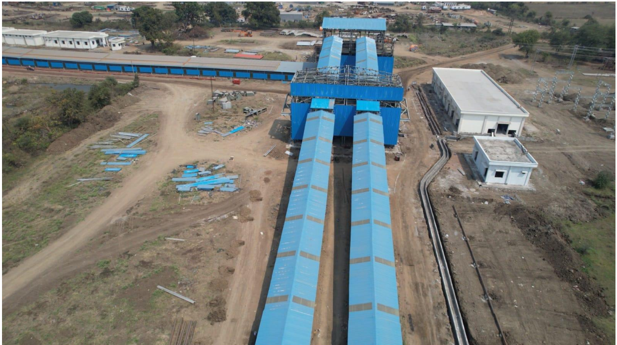
Figure 7 Transfer Point and Closed conveyor Belt System

The photograph of site showing the physical progress of the construction of railway siding with silo and belt are shown below: