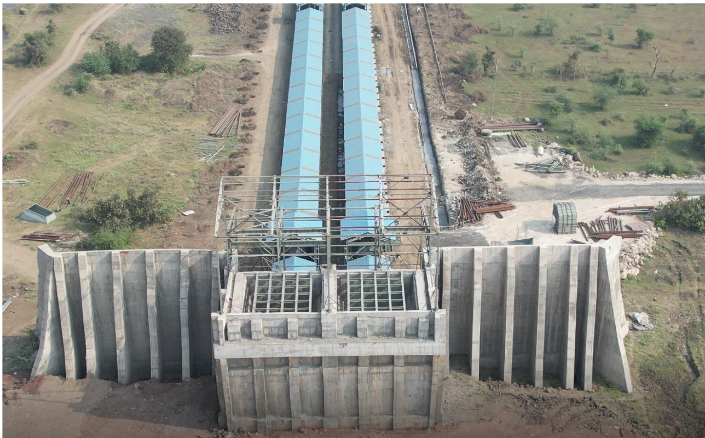
Figure 11 Truck Receiving Station