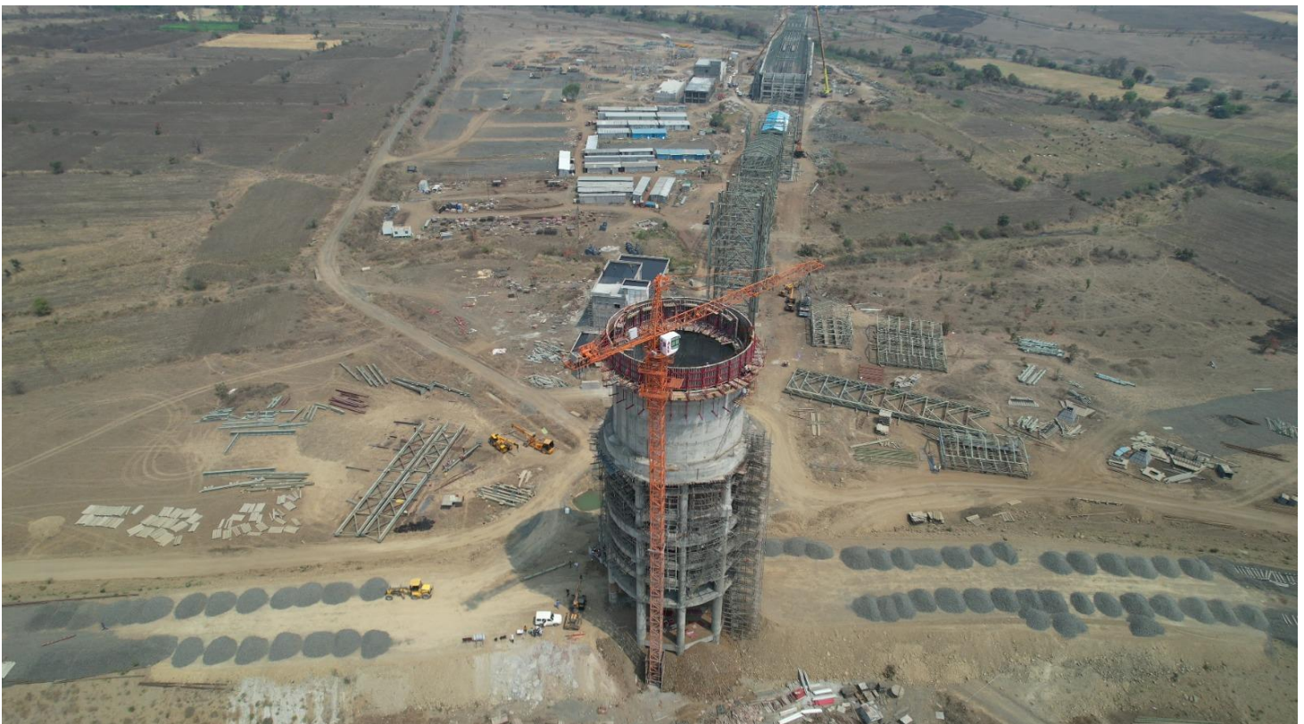
Figure 10 Silo under Construction