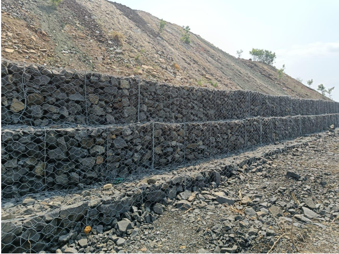
Figure 5 Gabion Wall Along OB Dump

Gabion wall has been constructed along the toe of OB dump. The work of “Making gabion structure along toe of the OB dump” was awarded vide work order no. वेकोलि / उ.श्रे / अ. आधि. (सिविल) / वर्क अवार्ड / 1927 / 50 / 2023 / 451 दिनांक 24 /25 .08.2023 for the total value of Rs 34,12,560.00 (Rupees Thirty four lakhs twelve thousand five hundred and sixty only).