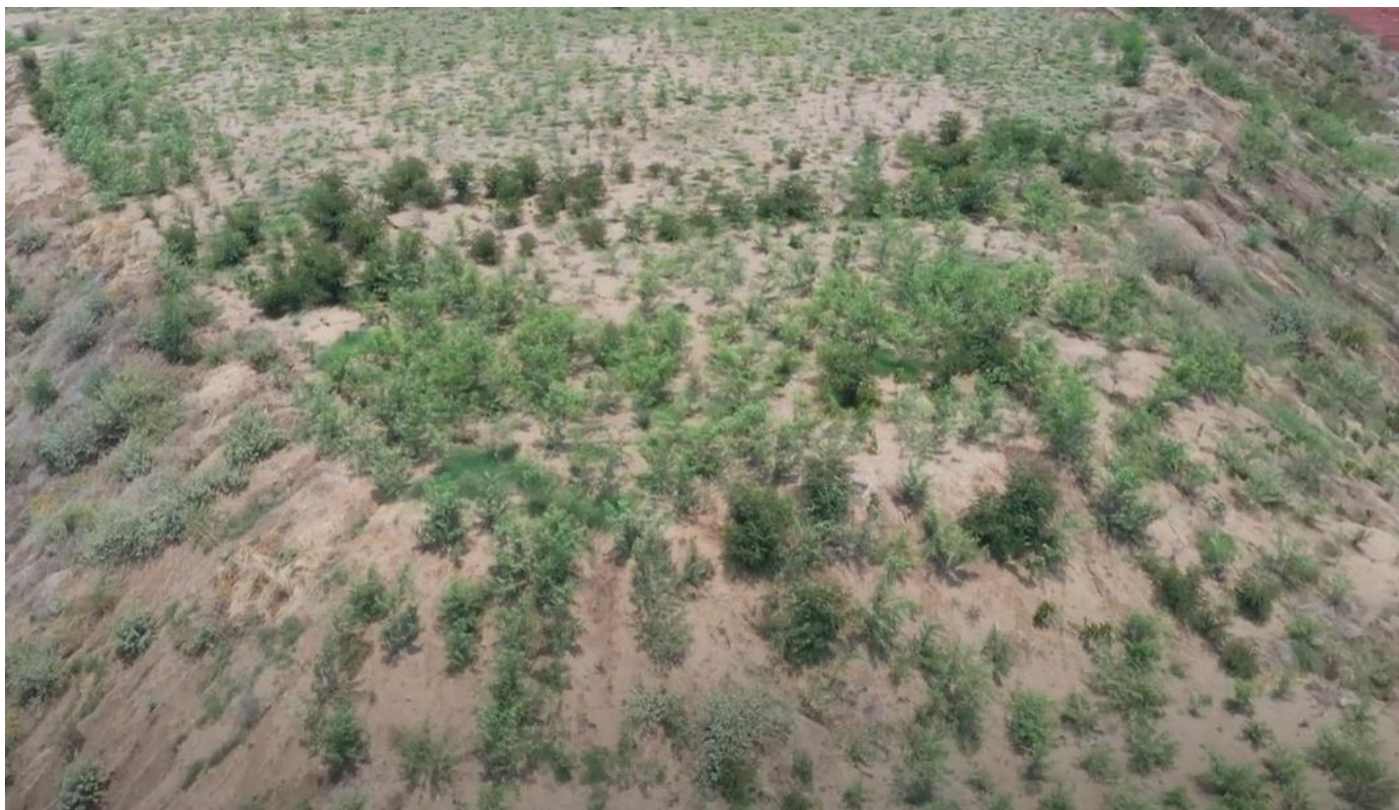
Figure 3 Plantation on Slope of OB