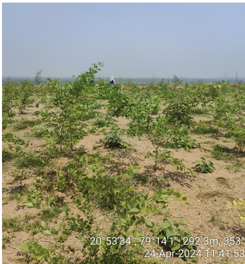
Figure 2 Plantation on OB Dump