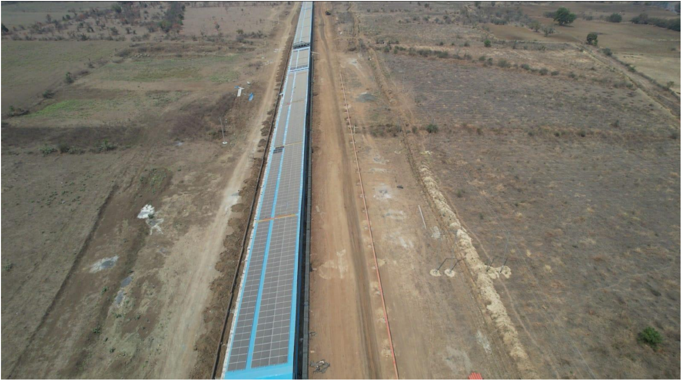
Figure 9 Closed conveyor belt arrangement with solar panel on top