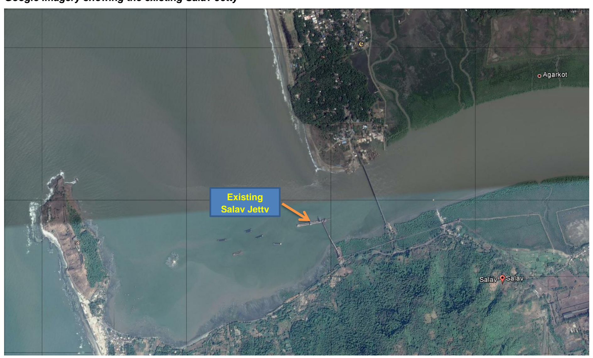
Appendix I Google Imagery showing the existing Salav Jetty