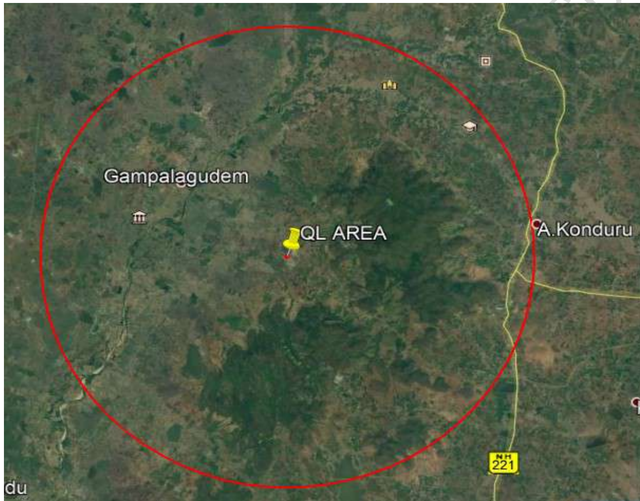
FIGURE - 3: GOOGLE MAP SHOWING MINE LEASE AREA