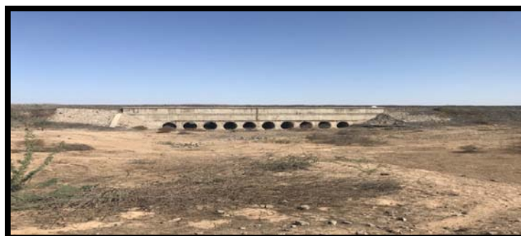
Figure 3: Photograph showing culverts for storm water drainage management at station A1.