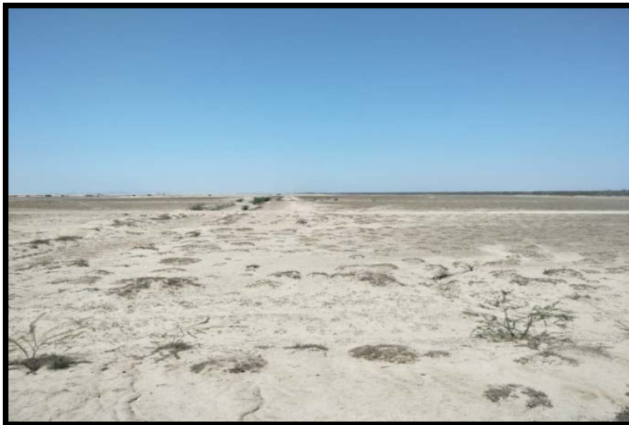
Figure 7: Abandoned saltpans region