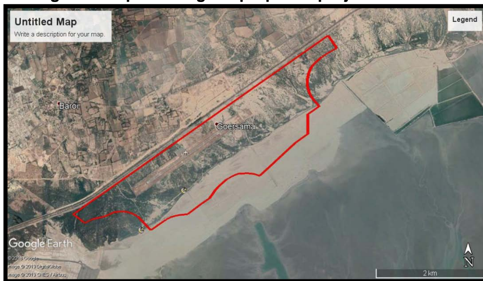
Figure 1 Map showing the proposed project boundaries

After getting recommendations of Gujarat Coastal Zone Management Authority, the company applied for Terms of Reference (ToR) for the said project in the month of June 2017. In the 21 st meeting of EAC (Infra 2) MoEF&CC meeting held in August 2017, the ToR was granted to MIAPL. Subsequently the company applied for EC and the project was discussed in the 38 th meeting EAC (Infra 2) which was held from 6-8 Feb 2019 wherein the EAC felt for a site visit before granting EC to the project.