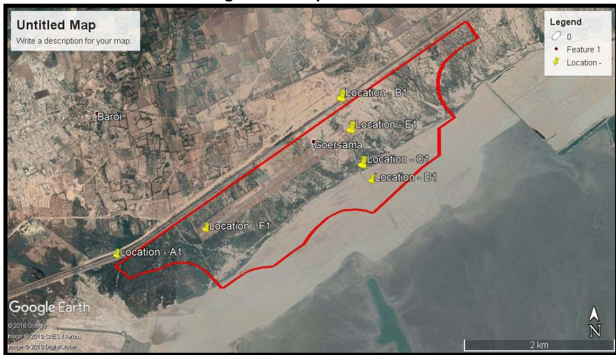
Figure 2: The places visited