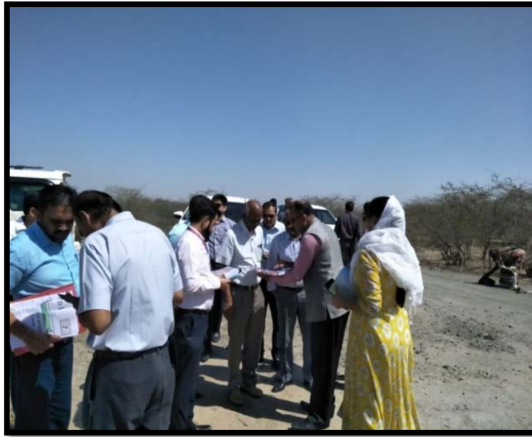
Figure 6: Location C1