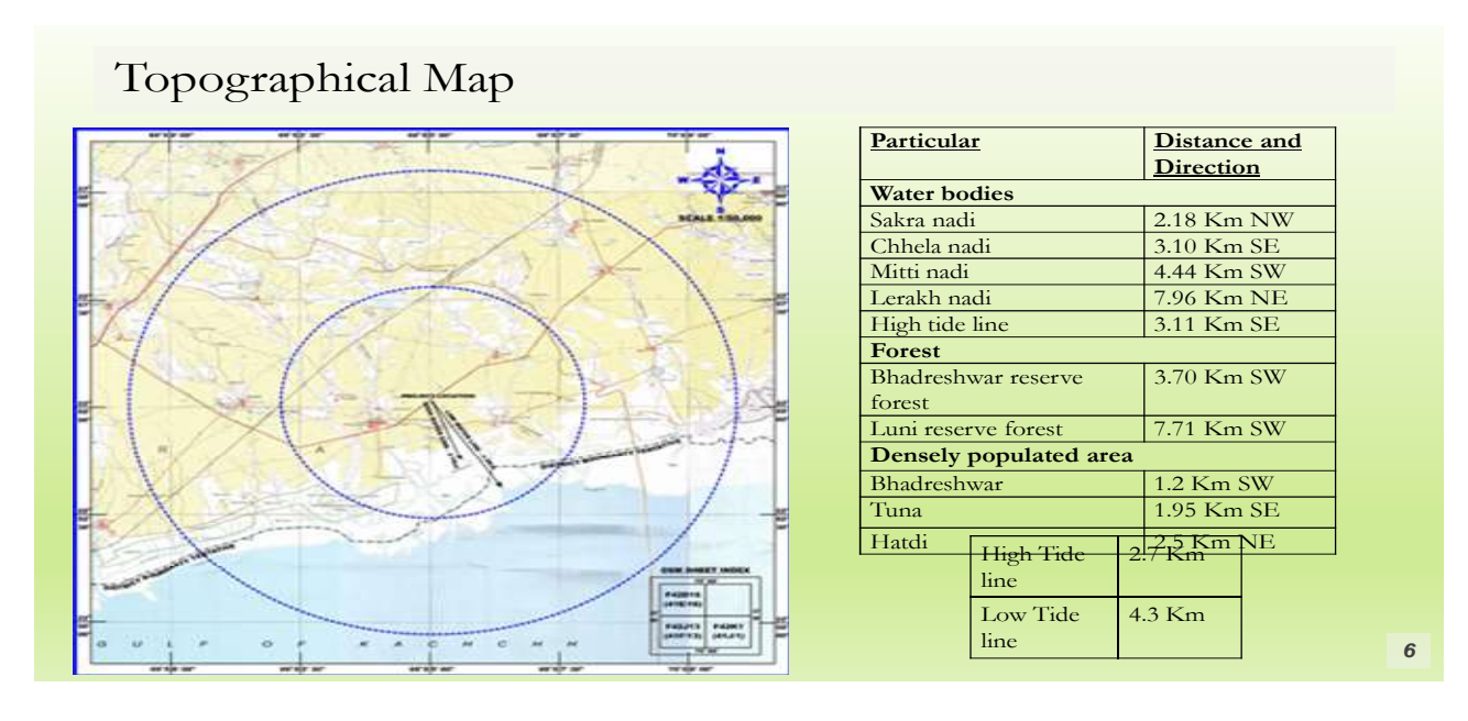
Slide 7 Project Site to be shown on Google Earth/DSS through KML/SHP File