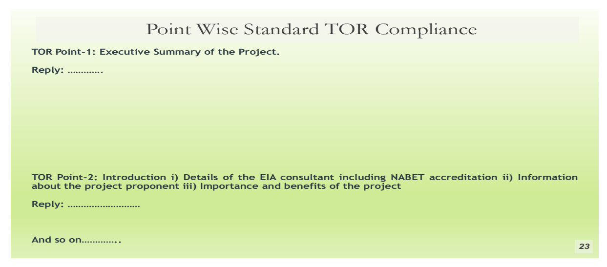
Slide 23 : TOR wise compliance presentation