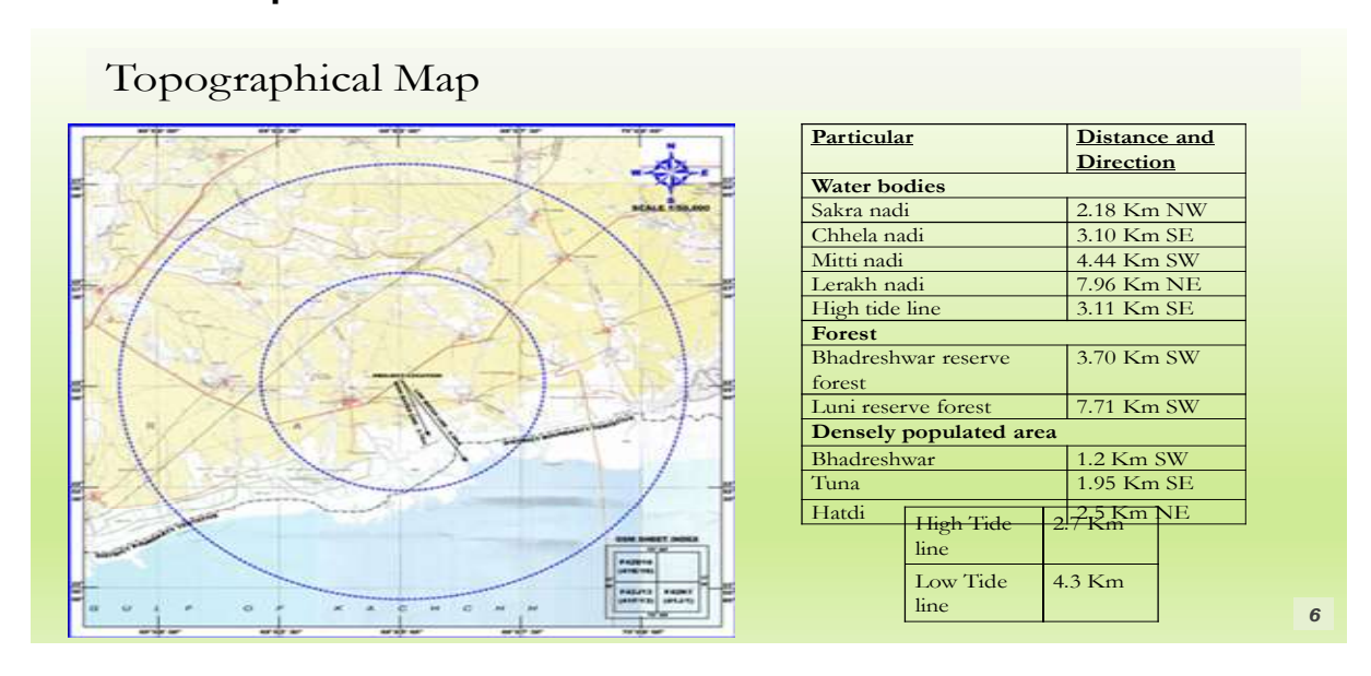
Slide 7 Project Site to be shown on Google Earth/DSS through KML/SHP File