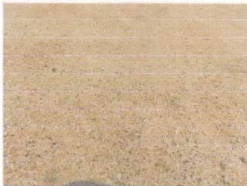
General view of the Proposed Area