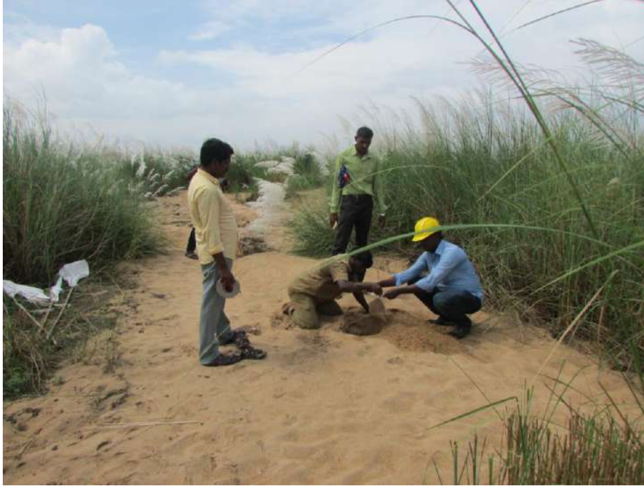
Fig No2.b-Collection soil sample