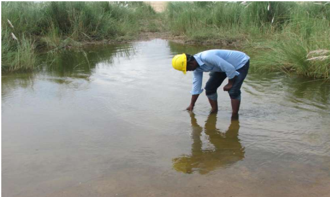
Fig: No: 3: Collection of Water sample

Quarrying does not have any significant impact on the water quality, as the neither quarrying nor intercept with the ground water level neither there is any surface water body near the site.