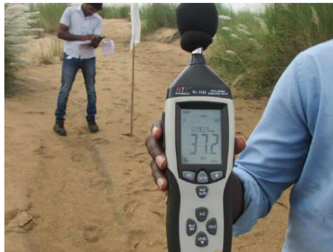
• Fig: No: 4: Measuring Noise Level

[Handwritten Signature] Executive Engineer, WRD.,