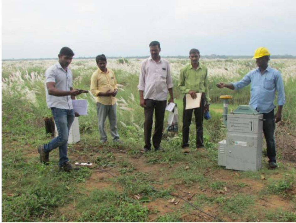
Fig: No: 5: Ambient Air monitoring

The major part of the dust generated during such operations usually gets settle down and thus the effect of such operation will be localized phenomenon.