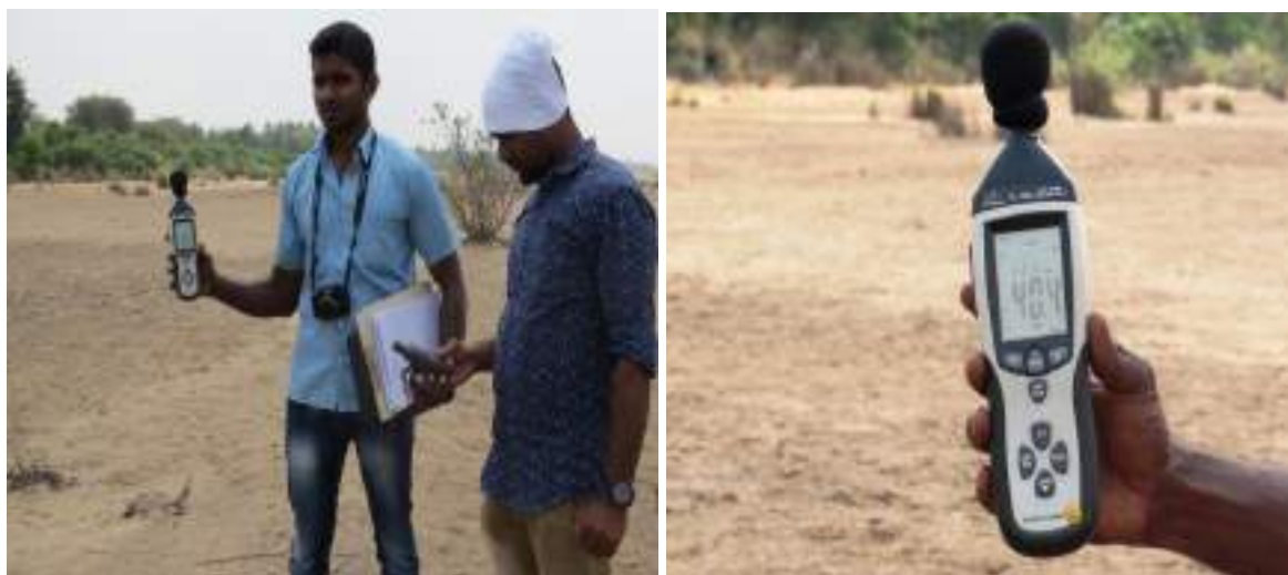
Fig.5: Image showing Noise level study along the lease boundary

Major noise generating sources may be considered as excavation, drilling blasting, loading and vehicle movement during transportation of minerals. With the starting of quarrying operations, it is imperative that noise levels shall increase. In order to assess the impact baseline ambient noise level, noise monitoring has been carried out at different points using Sound level meter