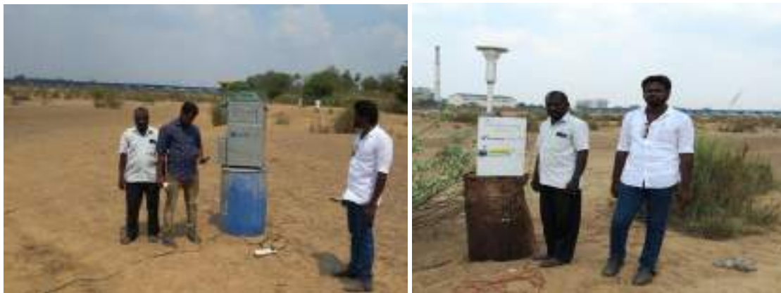
Fig: No: 6: Ambient Air Monitoring

Drilling and blasting operations are source of fugitive dust emission but its effect is more or less localized. Ambient Air monitoring has been carried out in the core zone.