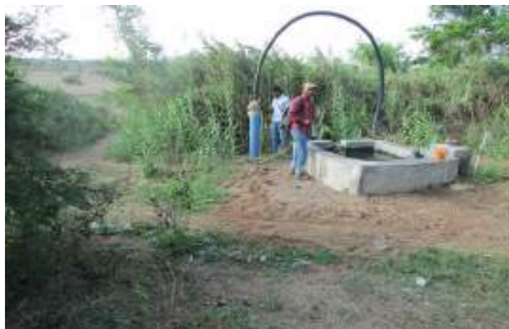
Fig: No: 4: Collection of Water sample

Quarrying does not have any significant impact on the water quality, as the neither quarrying nor intercept with the ground water level neither there is any surface water body near the site.