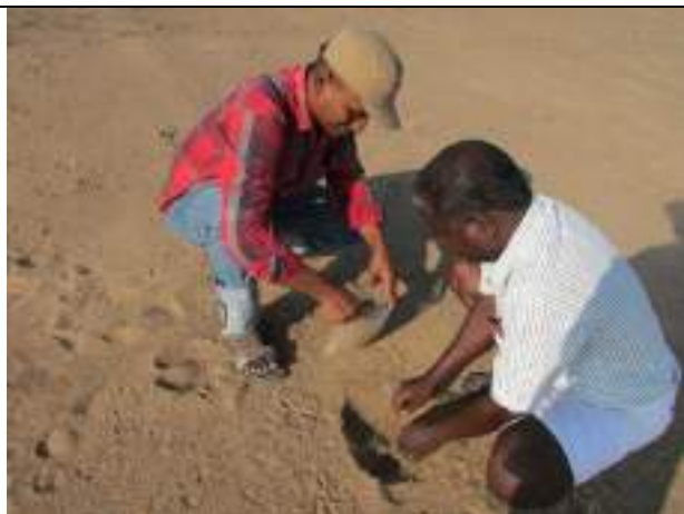
Fig No: 2.Collection soil Sample