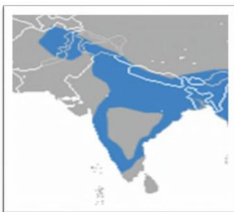
Distribution Range of Indian Leopard

On the Indian subcontinent, topographical barriers to the dispersal of this subspecies are the Indus River in the west, and the Himalayas in the north. In the east, the lower course of the Brahmaputra and the Ganges Delta form natural barriers to the distribution of the Indochinese leopard. Indian leopards are distributed all over India, in Nepal, Bhutan, Bangladesh and parts of Pakistan. In the Himalayas they are sympatric with snow leopards up to 5,200 m (17,100 ft) above sea level. They inhabit tropical rain forests, dry deciduous forests, temperate forests and northern coniferous forests but do not occur in the mangrove forests of the Sundarbans. Even though the Leopard is found all across the country there is no reliable estimate of its population. A review of literature regarding population densities of Leopard in Asia indicates that although the species may have a wide geographical range, it is unlikely to occur in relatively high abundance.