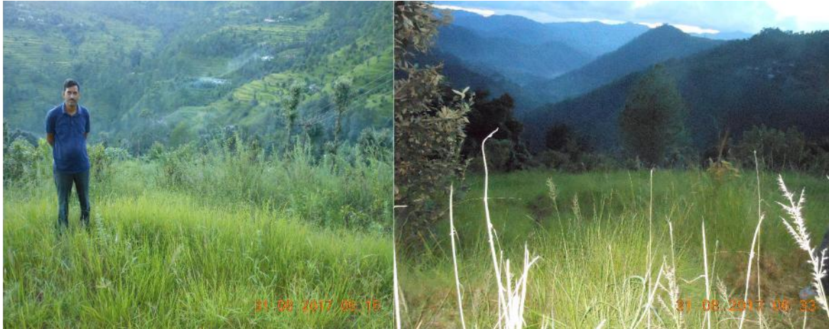
A VIEW OF PROPOSED LEASE AREA

PROPOSED PRODUCTION CAPACITY: 66589 TONNES