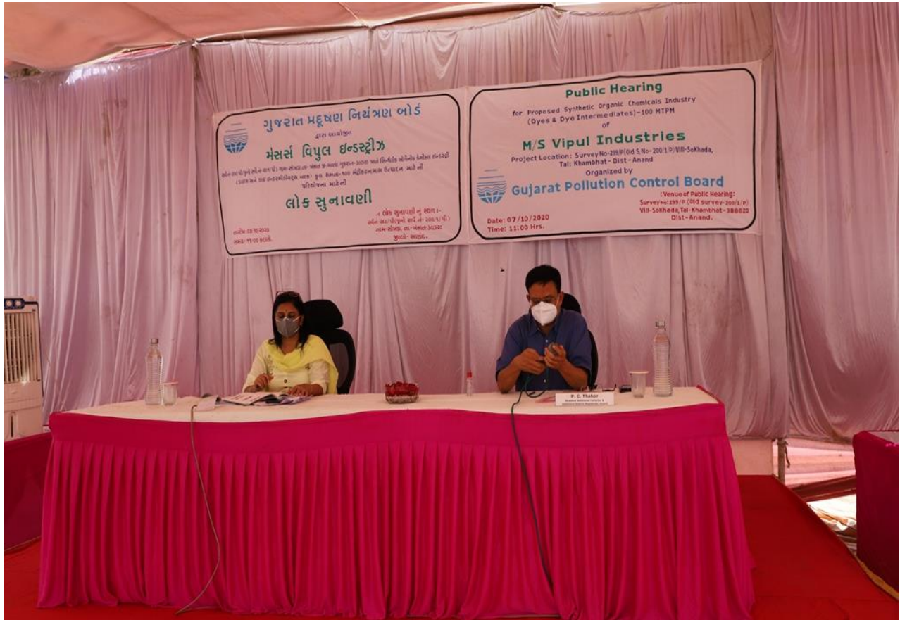
Figure 7.1: Photographs of Public Hearing