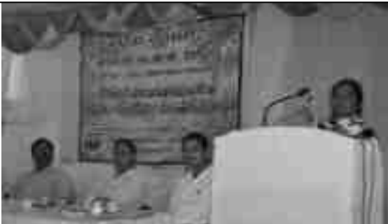
Views expressed by villager