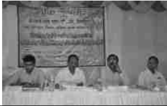
L to R District Mining Officer, Addl. Dist. Collector, R.O - CECB, Jagdalpur & Jt. G.M (Prod) NMDC