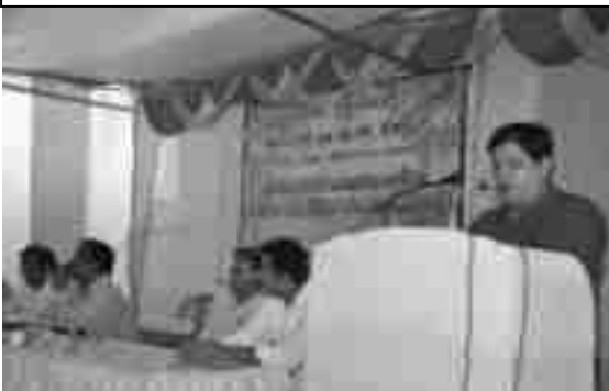
PH presentation given by EIA Consultant