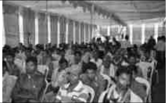
Local villagers from Gram Panchayat - Kadampal, Hiroli, Kodenar, Madadi attended the PH