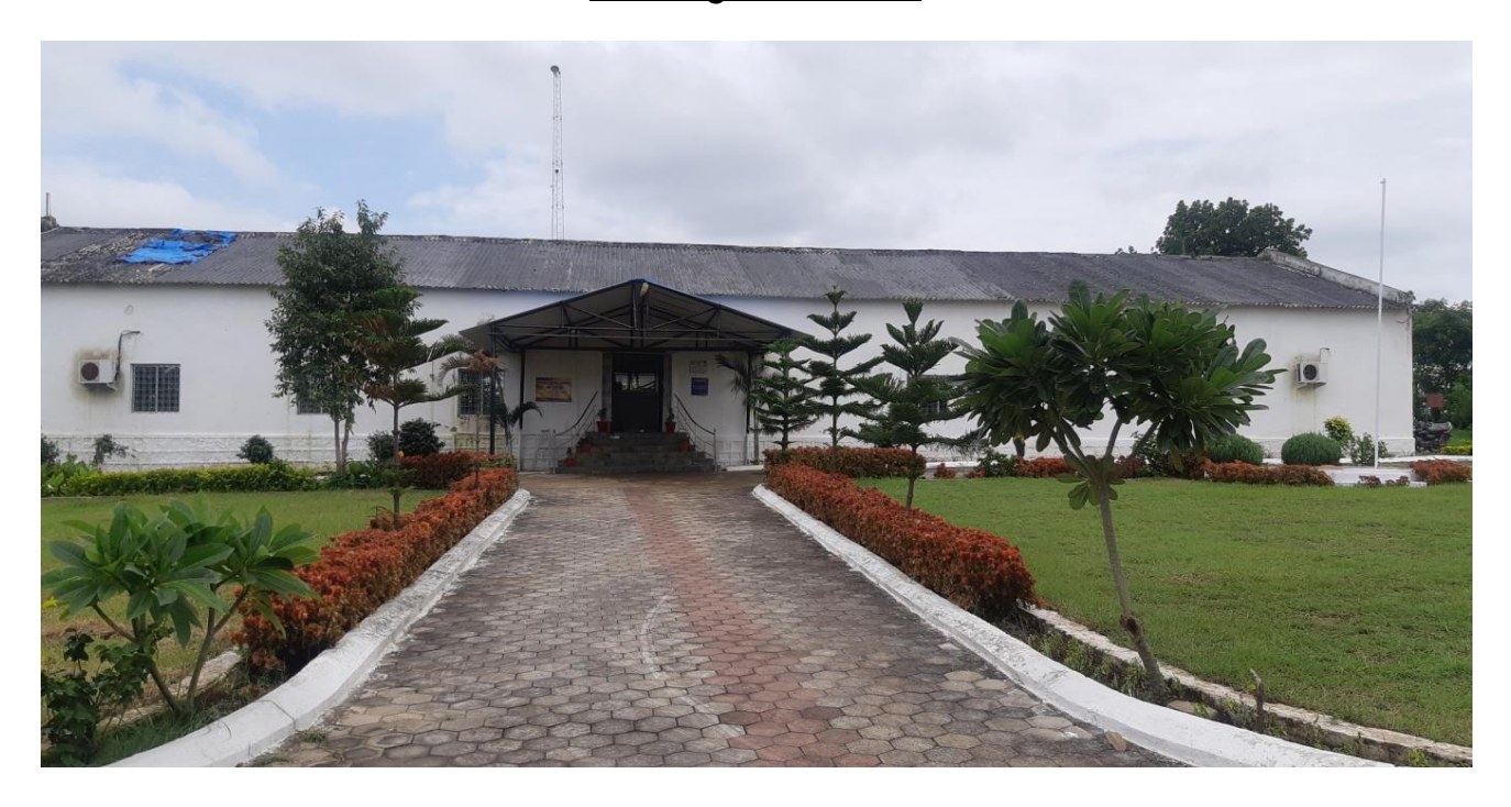
Existing Site Office