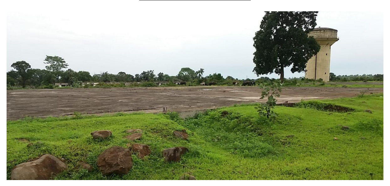
Over Head Water Tank