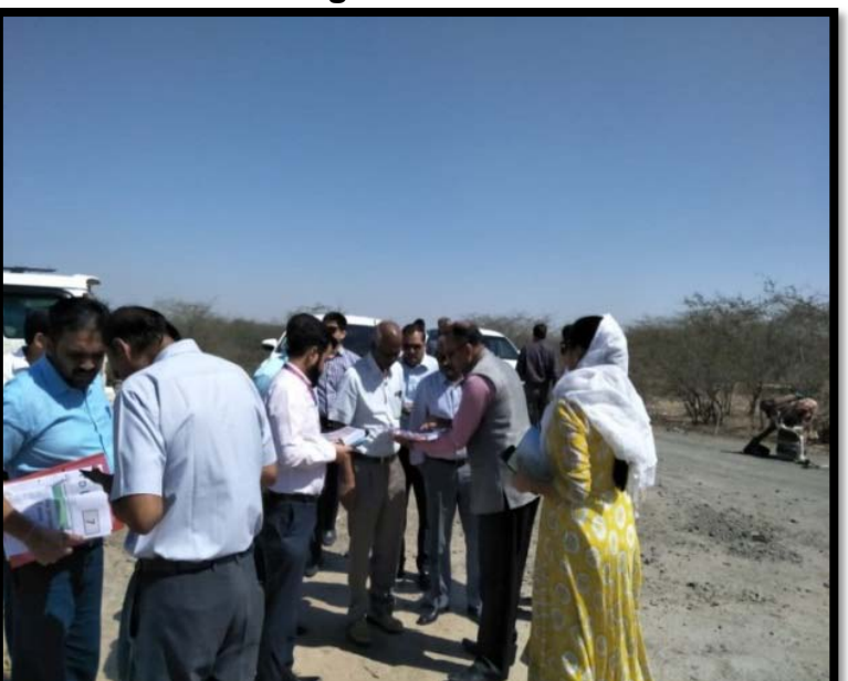
Figure 6: Location C1

• Team also visited location D1 and found that no activity related to salt works are carried out as it is now abandoned saltpans region.