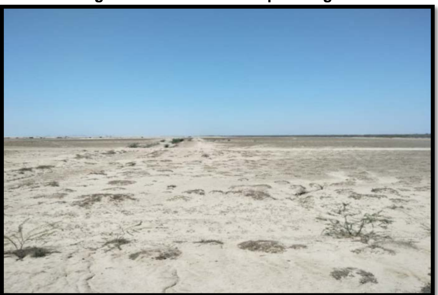
Figure 7: Abandoned saltpans region

• Team also visited location D1 and found that no activity related to salt works are carried out as it is now abandoned saltpans region.