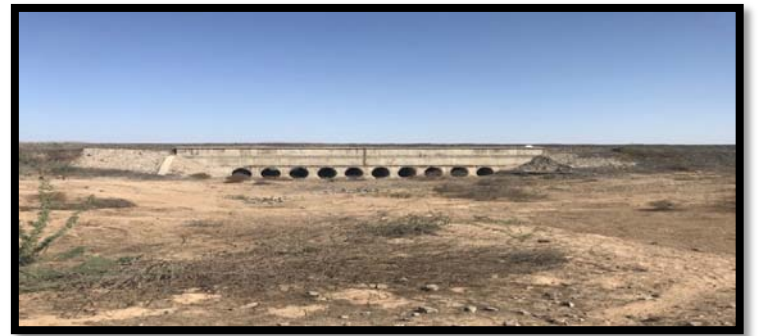
Figure 3: Photograph showing culverts for storm water drainage management at station A1.

• Sub- Committee verified the storm water drainage plan submitted by Project Proponent.