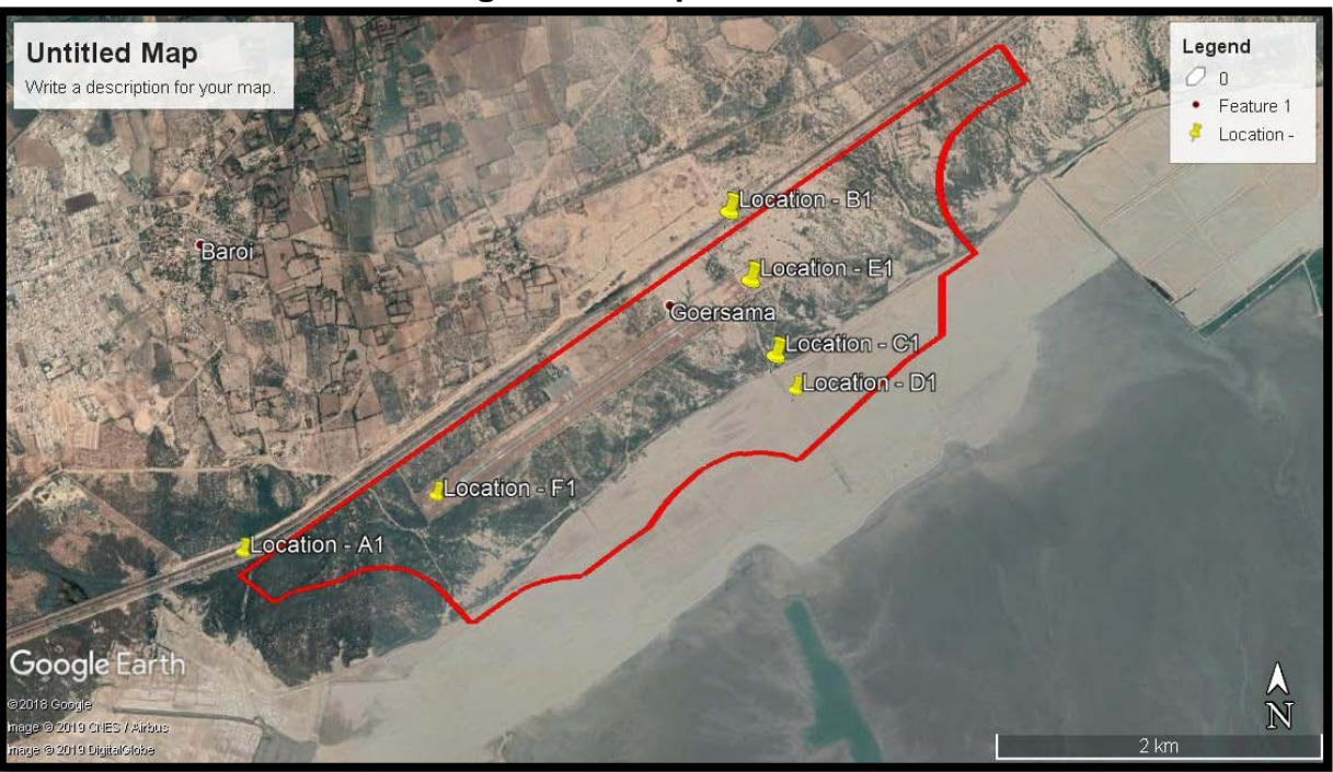
Figure 2: The places visited

The team visited by road all along the project boundary (Airport) from southwest to northeast. The road falls outside the proposed boundary. From the location A1, a dense green cover was observed and density of which seems to be reduced after 100 m of distance.