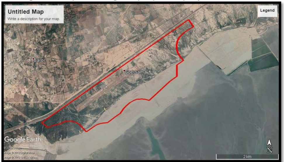
Figure 1 Map showing the proposed project boundaries

After getting recommendations of Gujarat Coastal Zone Management Authority, the company applied for Terms of Reference (ToR) for the said project in the month of June 2017. In the 21<sup>st</sup> meeting of EAC (Infra 2) MoEF&CC meeting held in August 2017, the ToR was granted to MIAPL. Subsequently the company applied for EC and the project was discussed in the 38<sup>th</sup> meeting EAC (Infra 2) which was held from 6-8 Feb 2019 wherein the EAC felt for a site visit before granting EC to the project.