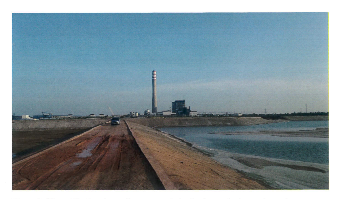
Figure 5. View of both ash ponds common to both phases (only one in use)