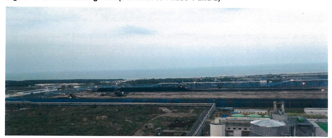
Figure 4. Panoramic view of coal handling yard (common to Phase 1 and 2)