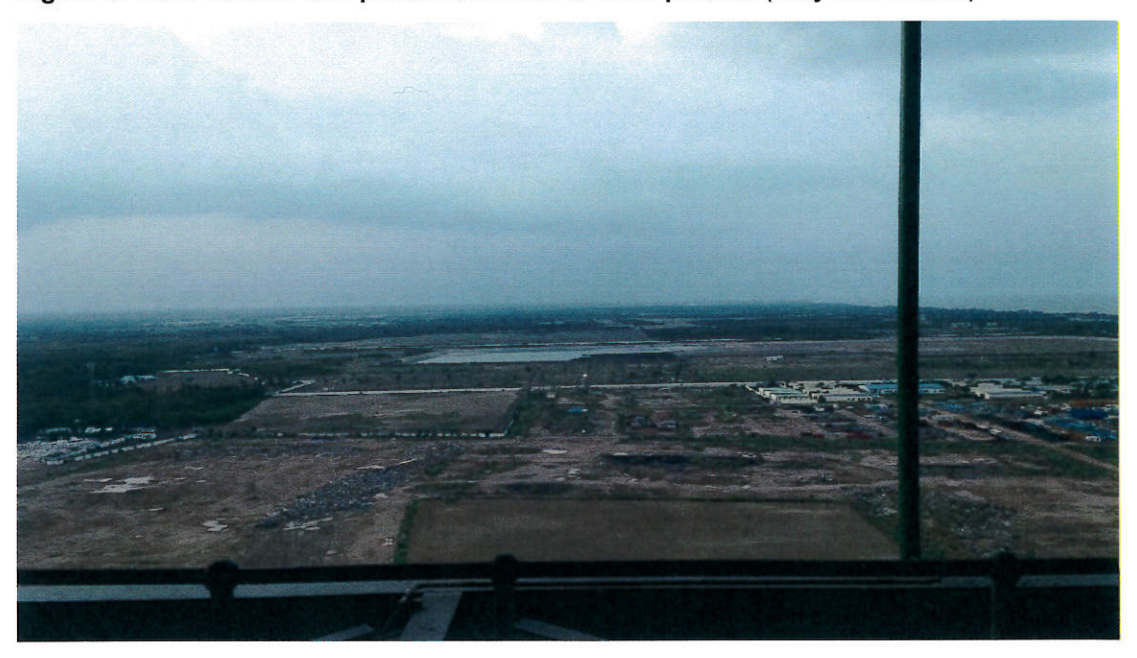
Figure 6. View of land earmarked for Phase 2, with ash pond in background

4. The documents provided by ITPCL confirm that though several court cases are pending, there is currently no legal bar for them to continue the construction of the remaining units of their TPP.