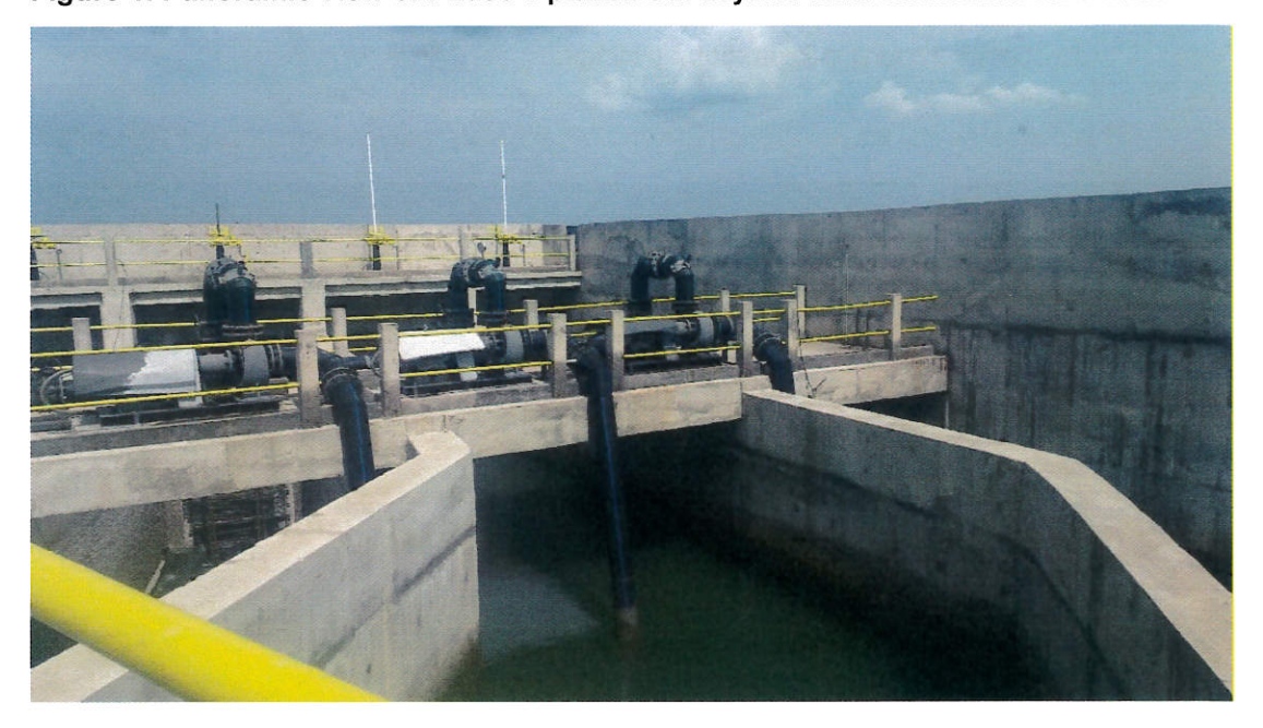
Figure 2. Seawater intake structure (common to both phases)