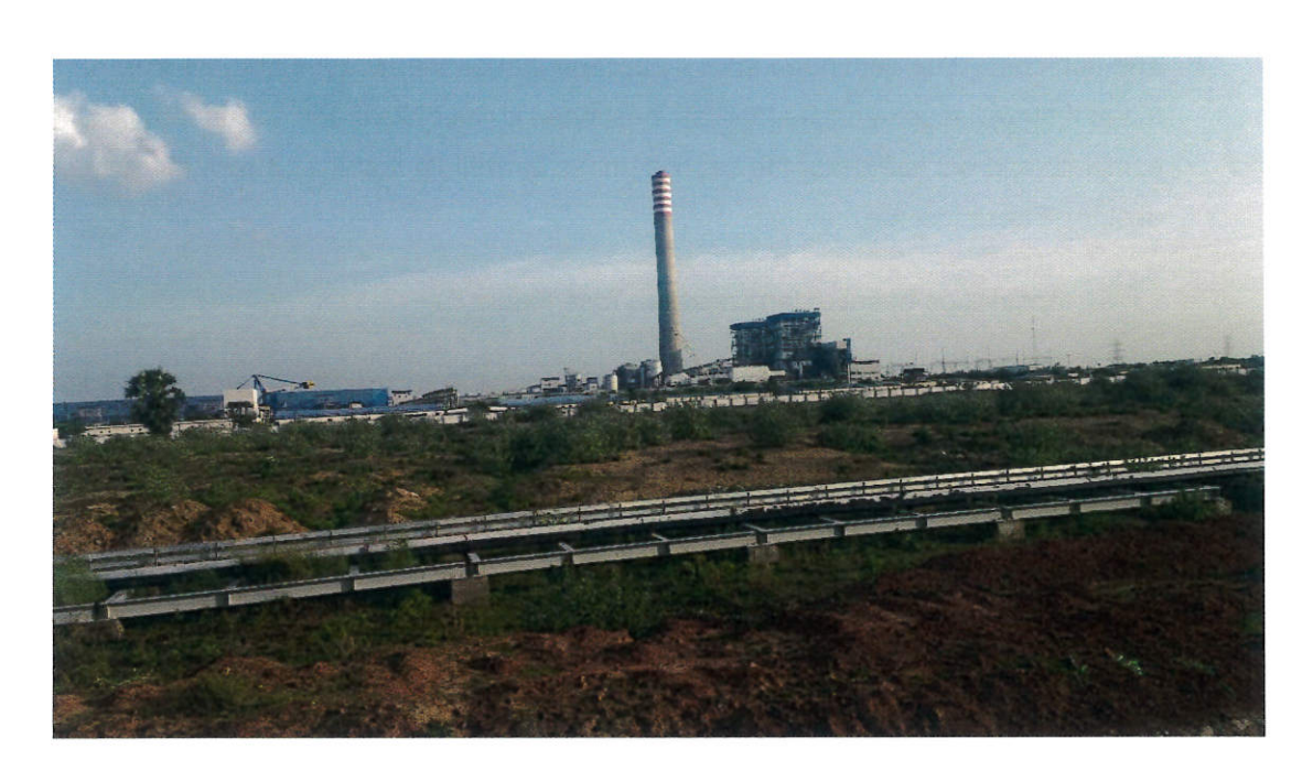
Figure 1. Panoramic view of Phase 1 plant from beyond land earmarked for Phase 2