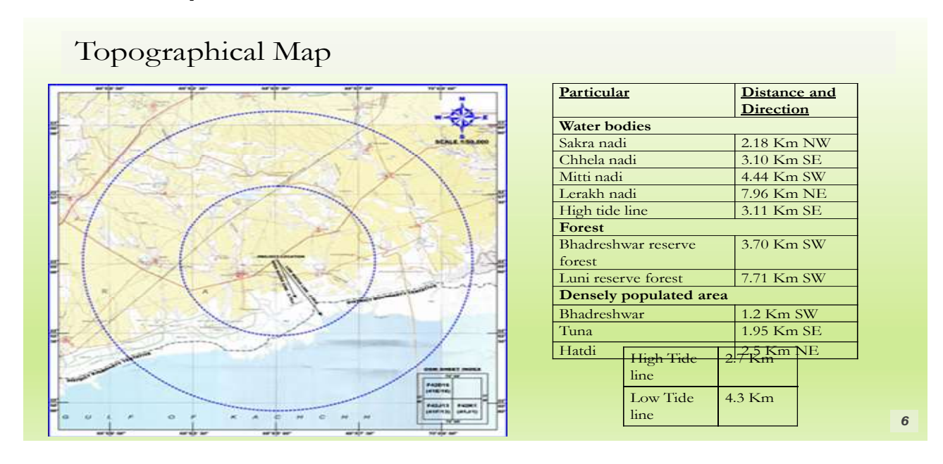
Slide 7 Project Site to be shown on Google Earth/DSS through KML/SHP File