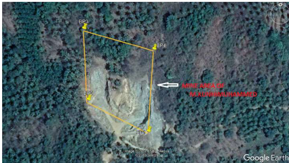
Figure 1.2 Google Map with site superimposing