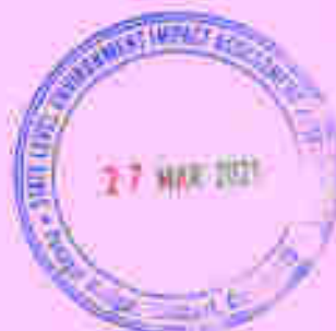
MEMBER SECRETARY SEIAA-TN