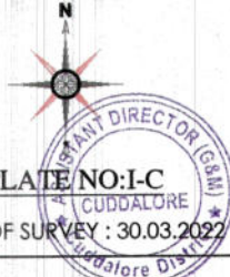
PLATE NO: I-C CUDDALORE DATE OF SURVEY : 30.03.2022